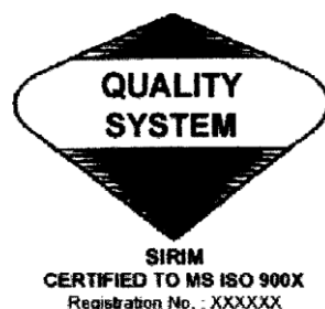
Figure 3. Diagrams of Certification Marks