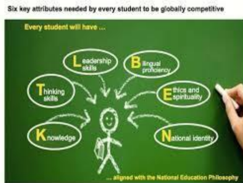
Figure 1: Dimensions of Student Success