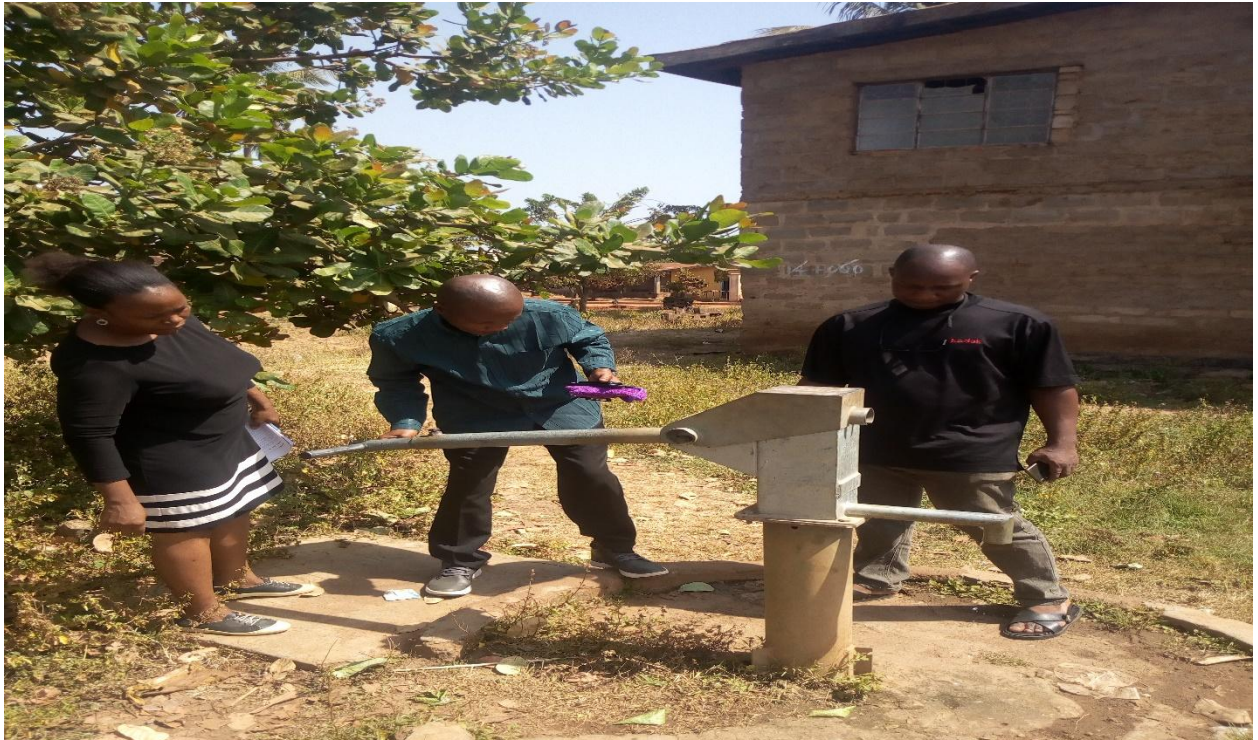
Fig. 1: Researchers assessing rural water project in Ikaram Community