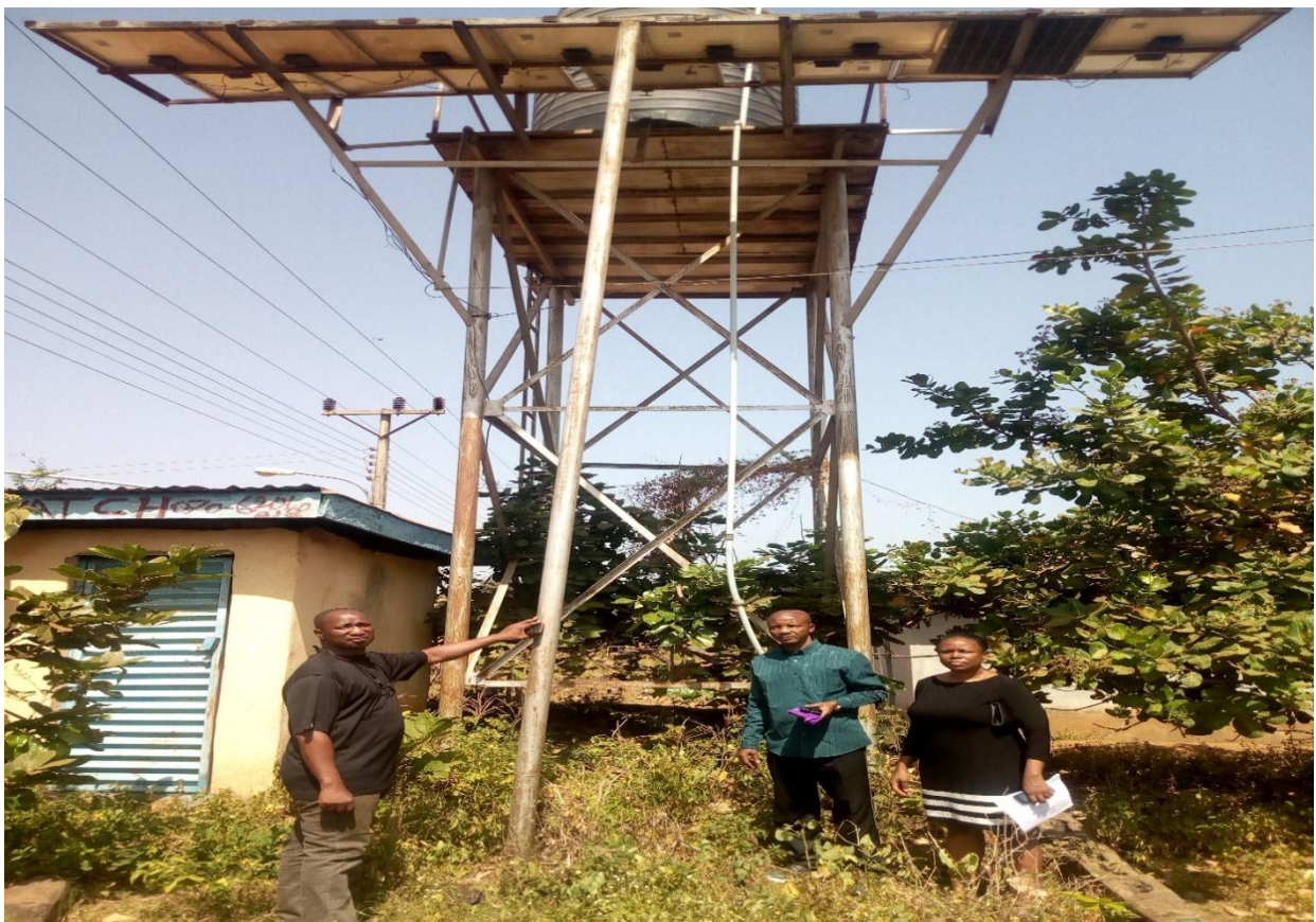
Fig. 2: Pictorial view of rural water project in Ijagba/Imoru Community

my brothers and sister, please tell government to give us portable water and regular supply of electricity. We pay our