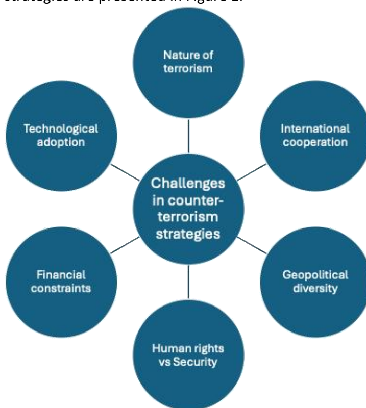
Figure 1. Challenges in counter-terrorism strategies

Counter-terrorism strategies face complex challenges that are as diverse as the threats they aim to combat. Addressing these challenges requires a nuanced approach that considers the social, economic, and technological landscapes of each country. Moreover, fostering international cooperation and maintaining a delicate balance between security and civil liberties are crucial to developing effective and sustainable counter-terrorism measures. These strategies must continually evolve to adapt to the changing nature of terrorism and the global context in which they operate. Therefore, present study addressed challenges in counter-terrorism strategies are presented in Figure 1.