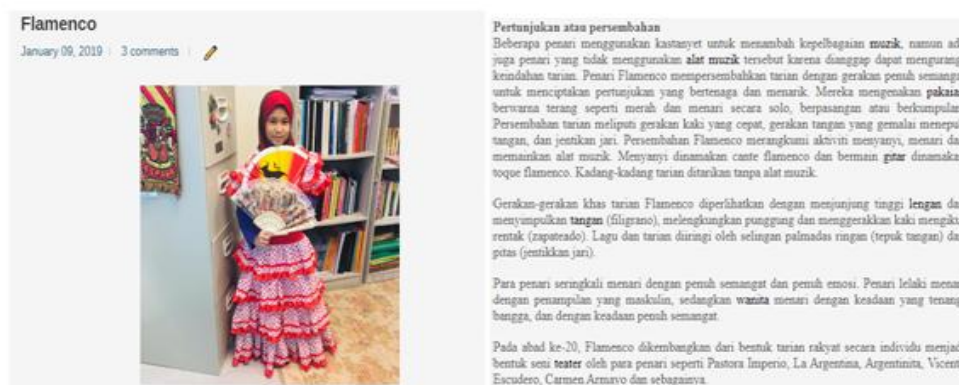
Figure 5: Spanish Traditional Dance: Flamenco.

Through this blog also, knowledge sharing will be exchanged among student with other users. Previous student's projects are shared with the current students and the learning process occurred. According to Cabrera (2002) knowledge sharing is an activity which knowledge such as skills, vocabularies, expertise are shared together among the students from other group and other users. Sharing also occurs borderless or without time constraint (Nur, 2009). The usage of blog nowadays, helps a lot in improving the education system in Malaysia.