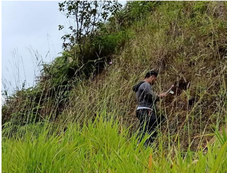
Figure 5. Process of collecting soil samples

The time and date of each sample were recorded, and their weight were measured using an electronic balance. The temperature and coordinates were also measured by utilizing a Weather software and Google Maps application on smartphone. The details were labelled on the soil samples collected as in Figure 6.