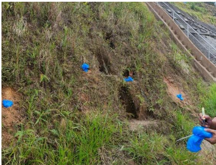
Figure 6. Process of labelling soil samples collected

The time and date of each sample were recorded, and their weight were measured using an electronic balance. The temperature and coordinates were also measured by utilizing a Weather software and Google Maps application on smartphone. The details were labelled on the soil samples collected as in Figure 6.