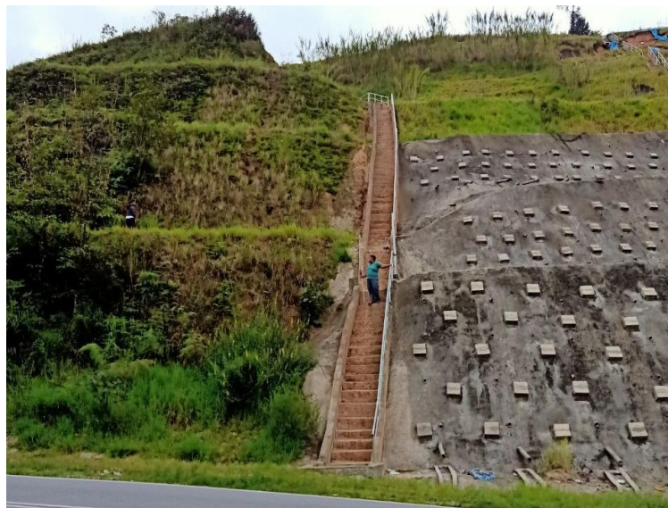
Figure 2. Photo of the site on October 2020

Previous studies confirmed the cause of these landslides were due to intense rainfall. Thus, this research was done to predict the soil strength of a previous landslide spot which took place in Kampung Raja, Cameron Highlands. This research was focused to collect soil samples, label and analyze them through moisture content analysis, then to evaluate the results, an existing model would be used.