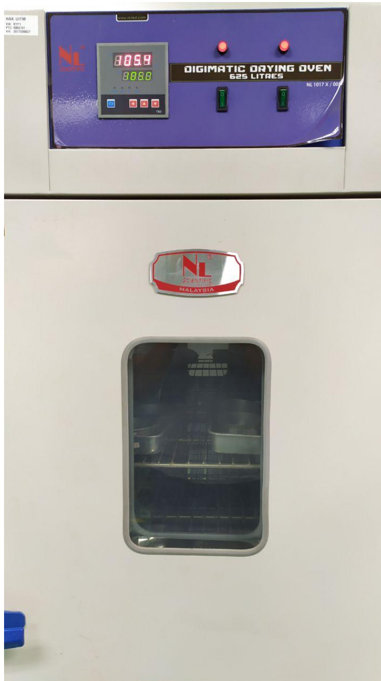
Figure 7. Soil samples and containers put in an oven for oven-dry process