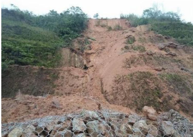
Figure 1. Photo of landslide in 2018 at Kampung Raja, Cameron Highlands