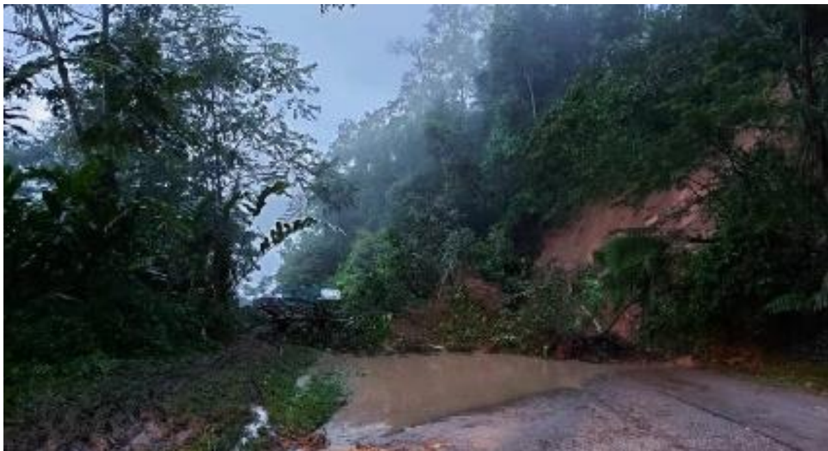
Figure 3. Landslide on October 2020 at Cameron Highlands

Although it remained as a favorite destination especially to local tourist, Cameron Highlands had often been reported for cases of landslides occurrences such in Figure 3. According to Nasidi et al. (2020), the land on Cameron Highlands were made up of two types of soil, mainly podzolic soil and lithosols soil. Yusoff et al. (2016) defined podzolic as type of soil with sandy texture, sensitive to severe degradation by human activities. Meanwhile, Vakilian (1978) defined lithosols as type of soil suitable for growing crops with adequate rainfall. Hadi et al. (2020) indicated that the surface of Cameron Highlands was made up of residual soil consisted of clay.