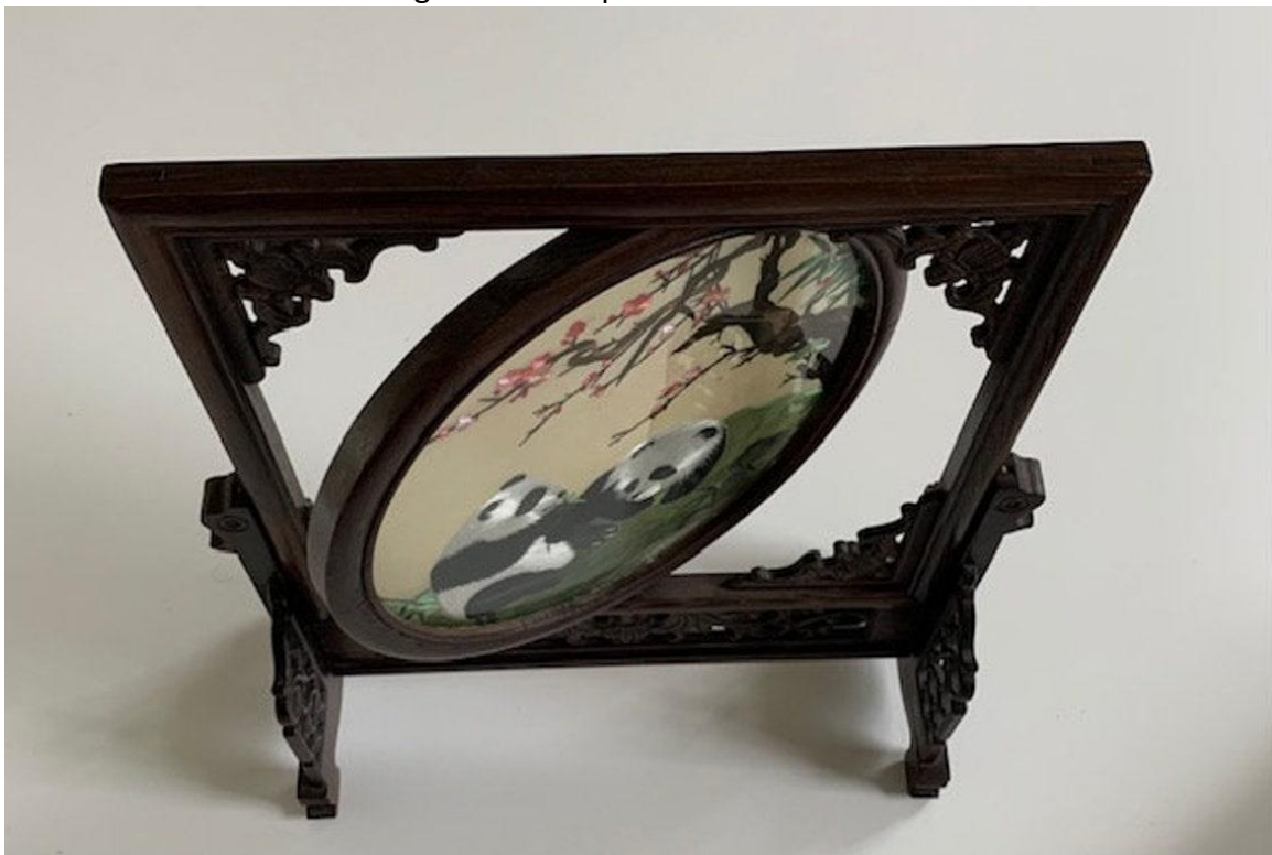
Figure 1: Suzhou double-sided embroidery

Other than a mere profession, Suzhou double-sided embroidery is living proof of the deep foundations of China's ancient cultural heritage. This art form has been evolving over a millennium in the city of Suzhou, crossing through the centuries, leaving its imprint on the dynasties, decorating the imperial courts, and becoming an integral part of life. The complex skill of interlacing patterns on both sides of the diaphanous silk cloth manifests the unmatched talent and the committed craftsmanship that has been passed down from generation to generation of skilled craftsmen (Suryanti et al., 2023). At its core, the possible loss of traditional embroidery represents a significant challenge to the fundamental essence of China's cultural identity. Although Suzhou embroidery is nothing more than an art form, it is also a very deep connection to a nation's historical fabric and its collective soul. The loss of such a treasured tradition brings out the importance of cultural conservation.