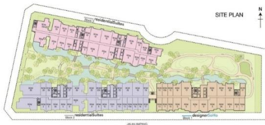
Figure 13 (a): SoHo Floor Plan

Small Office Versatile Office (SoVo) and Versatile Office Suites (Vos) are not distinguished from SoHo despite the different names. The size of these properties is within 400 sf – 800 sf. Complete with the business facilities, the units are preferred by start-up organisations. Notably, although the SoVo’s design is similar to SoFo, it is only applicable for commercial purposes. This property is categorised under the commercial title without any protection by the HDA jurisdiction.