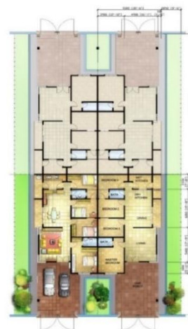
Figure 5: Cluster landed property floor plan

Table 5 shows that the range of semi-detached (Semi-D)/cluster houses price by State in Malaysia First Quarter 2019 in Malaysian House Price Index by Valuation & Property Services Department. Kuala Lumpur listed as the highest semi-detached/ cluster price at RM2,367,883 followed by Selangor at RM993,477, and the lowest price listed in Kelantan at RM252,223. In average, semi-detached/ cluster houses in Malaysia listed at RM647,737.