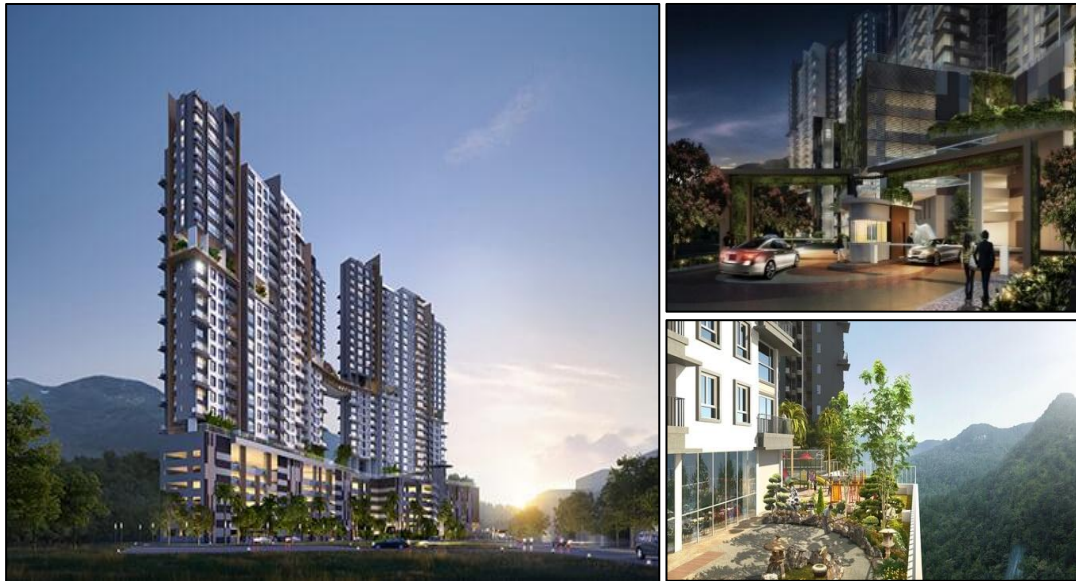
Figure 11: Condominium

Figure 11 shows a development by Developer Setia Promenade Sdn Bhd (S P Setia Berhad Group), Development: Setia Sky Vista, Relau, Pulau Pinang; Development info: 27-storey and 32-storey towers resided by a total of 426 residences. Setia Sky Vista comprises two towers connected to a majestic Sky Bridge, which offers various exclusive facilities. The residence area is within 910 sqft - 1,479 sqft with a launch price at approximately RM550 psf. The market price is within RM500k - 900k.