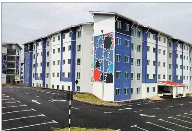
Figure 9: Flat Program Perumahan Rakyat (PPR), 418 units, 5 Storey Flat Machang PPR, Kelantan Darul Naim.

An apartment is normally of the height of five-storey and above. Surrounded by security, it is equipped with elevators and connected to outdoor parking space. The apartment consists of amenities, including landscape, playgrounds, parking spaces, and 24-hour security as shown in Figure 10. Notably, not only the apartment is a low cost, which leads to its suitability as a starter home, the cost for maintenance and service would be lower than the condominium cost. Comparatively, the affordability of an apartment is higher and frequently perceived to have higher accessibility as an investment method. Moreover, the range of the regular built-up size is 550 sf - 1,200 sf. Provided that the apartments situated close to LRT or along the MRT stations are the preferred choices for the rental market, the apartments are currently among the prevalent categories of residential property.