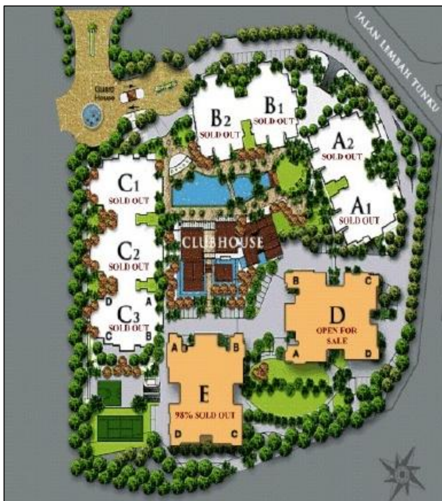
Figure 12 (b): Tinjani 2 North, Bukit Tuanku, Kuala Lumpur Development Layout Plan.