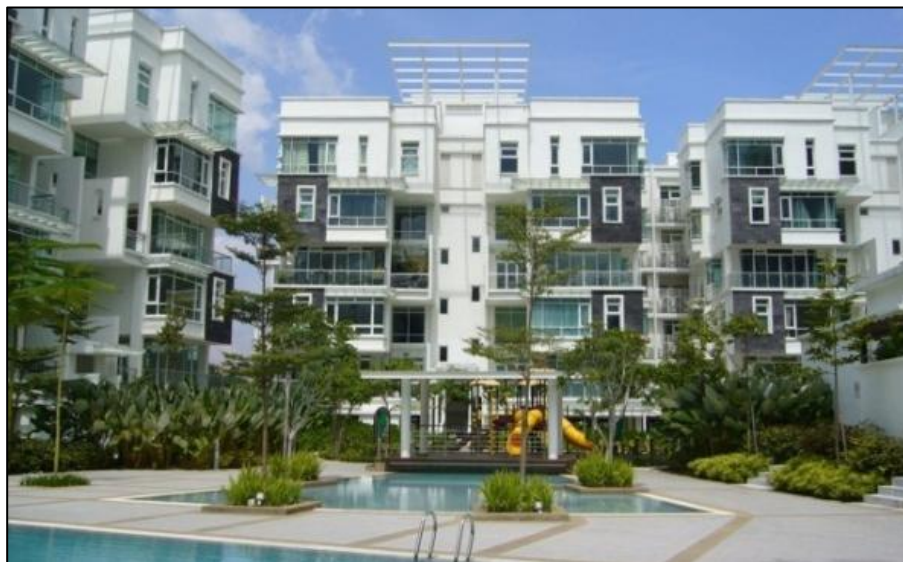
Figure 12 (a): Penthouse

Figure 12 (a) and (b) shows a development by developer Symphony Life Bhd, Development: Tinjani 2 North, Bukit Tuanku, Kuala Lumpur; Development info: There are 154 units available at Tinjani 2 North project with a built-up from 2,827 sf to 3,133 sf. With a launch price at approximately RM650 psf, it was completed in January 2009. The market price ranges from 1.61 to 3.01 million.