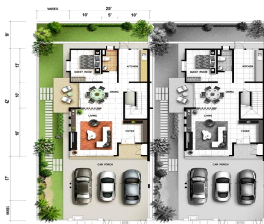
Figure 7: Zero-lots bungalow floor plan

Table 6 shows the range of detached/bungalow houses price by state in Malaysia First Quarter 2019 in Malaysian House Price Index by Valuation & Property Services Department. There are huge different range of detached/ bungalow houses between Kuala Lumpur and others state in Malaysia. Kuala Lumpur listed at RM3,884,605 which is more than RM3 million different from others state. In average detached/ bungalow houses listed at RM661,968 in Malaysia