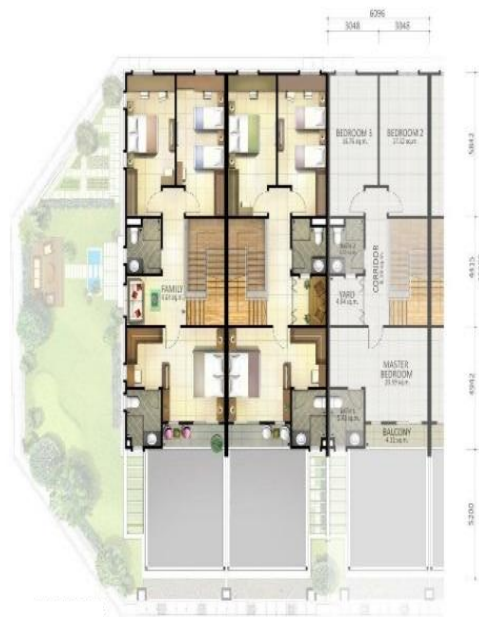
Figure 3: Terrace house floor plan