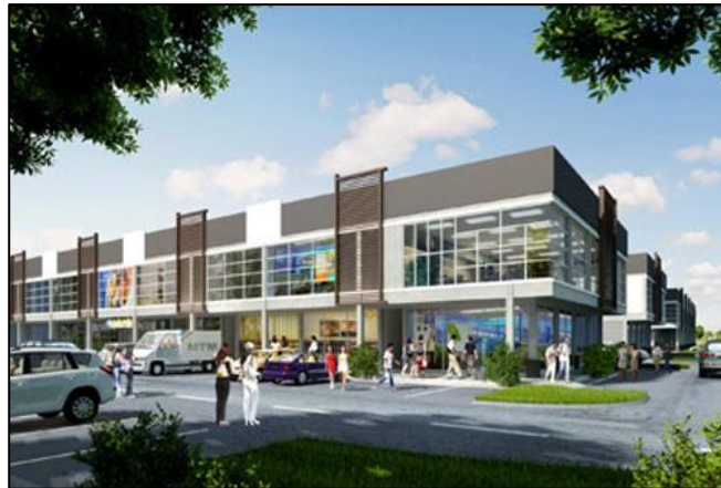
Figure 14: Shophouses, Developer: Naim Land Sdn Bhd, Development: Two-storey shop houses at Desa Bahagia, Permayajaya, Miri

Shophouses are homes situated on top of the shops. Despite the commercial name carried by the shops, the houses can be provided with a residential title based on the developer's capability to implement the residential title. If the developer is not able to modify the land title to residential title for the homes, the homes will not be granted with HDA protection.