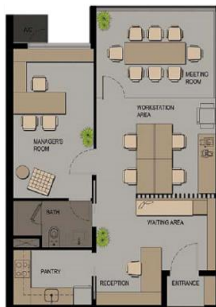
Figure 13 (c): SoHo - Office

Figure 13 (a), (b) and (c) shows the development by developer Oasis Garden Development Sdn Bhd (Mah Sing Group); Development: M-City, Jalan Ampang; Development info: M City is a 4.96-acre freehold mixed development, which has a potential to be suitable for individuals to reside in, work, have fun, and play through the combination of serviced apartments, SoHo, sky villas, and boutique three-storey shops. Comprising four layouts, the built-area ranges