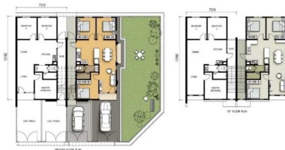
Figure 8: Two-storey townhouse floor plan

The regular built-up size amounts from 560 sqft to 7,000 sqft. While several units have a similar entrance and porch area, other units begin with different entrances, which are situated at the front, back or beside each other. Variation is also present in the layouts due to the separation between several two-storey units to provide a space for each owner on one level. Meanwhile, partitions could be created in the three-storey units to ensure that a floor and a half is occupied by every owner.