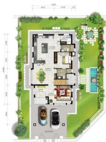
Figure 6: Bungalow floor plan

Bungalows are independent building on vast land area, which is normally the property of the bungalow owner. Furthermore, the construction of bungalows is to commemorate spacious living. Being prominent in Malaysia, this type of building comprises numerous rooms, with the regular built-up size for a bungalow ranging from 2,000 sqft to 12,500 sqft. However, the built-up size could expand until it develops into one of the most prominent residential methods. The cost of the bungalow also varies widely based on the location and land area. Notably, the zero-lot bungalow has similarities with the bungalow, with the size of its area an exception. To illustrate, the area is small, with the house being situated in a corner of the plot of the area to optimise the compound space. Figure 6 and 7 show the example of bungalow and zero-lots bungalow floor plan.