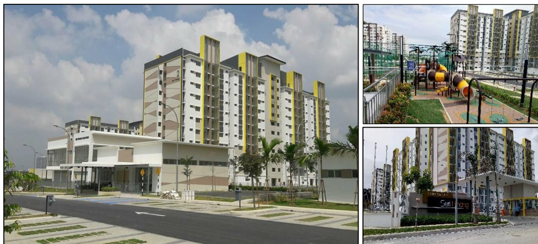
Figure 10: Apartment, Developer: S P Setia Berhad Group, Development: Seri Pinang Apartment, Setia Alam, Selangor.

An apartment is normally of the height of five-storey and above. Surrounded by security, it is equipped with elevators and connected to outdoor parking space. The apartment consists of amenities, including landscape, playgrounds, parking spaces, and 24-hour security as shown in Figure 10. Notably, not only the apartment is a low cost, which leads to its suitability as a starter home, the cost for maintenance and service would be lower than the condominium cost. Comparatively, the affordability of an apartment is higher and frequently perceived to have higher accessibility as an investment method. Moreover, the range of the regular built-up size is 550 sf - 1,200 sf. Provided that the apartments situated close to LRT or along the MRT stations are the preferred choices for the rental market, the apartments are currently among the prevalent categories of residential property.