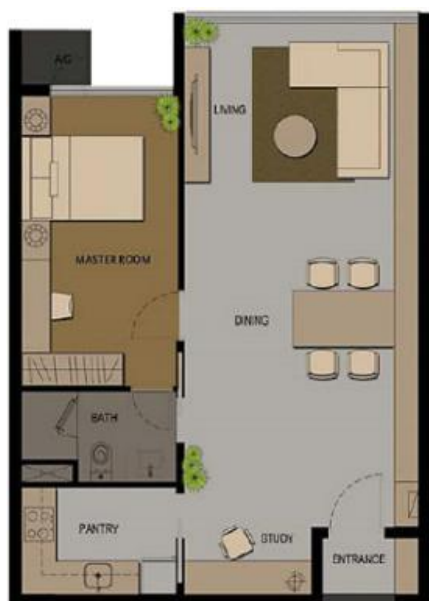
Figure 13 (b): SoHo - House