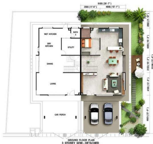
Figure 4: Semi-D floor plan