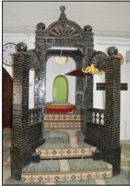
Picture 4. Pulpit of Al-Jamhuriyah Old Mosque, Kuala Besut.

The size of the stairs in terms of width and height and the height of the pulpits being studied depends on the size of the pulpit of each state. The size of the steps also differs where the size of the width for the top stairs are usually wider as at that level, the imam's seat is placed. The seat mentioned is built with a chair to make it easy for the imam to deliver religious lectures or sermons. There are also some steps that are wider and higher up to the main plateau where the imam is seated. However, there are also a number of mosque pulpits that have wider first step than the second and third. Despite that, the steps for the stairs is longer and wider beginning from the first step, making it seem conical upwards and also decorated with designs.