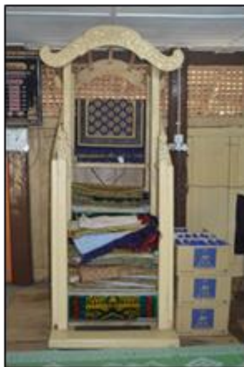
Picture 3. Pulpit of Old Mosque at Tuan Village, Kemaman

Pulpit stairs during Rasulullah's time is located at the front where when Rasulullah goes up the stairs, he will be facing away from the jemaah , but will face the jemaah when he delivers the khutbah. That way, all the jemaah present will be able to see Rasulullah's whole body clearly. However, most of the newer pulpits built around 2009-2014 being studied revealed that majority of the stairs are located at the right and not at the front such as at older mosques. The following is an example of the position of the old pulpit in Terengganu (Picture 3) showing that the stairs were in front of the pulpit as in the time of the Prophet.