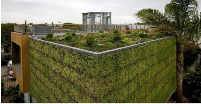
Figure 2: Green Roofs and Green Walls. Green roofs involve planting vegetation on rooftops, while green walls are vertical gardens attached to buildings. These features offer insulation, reducing heating and cooling costs, improve air quality, and provide aesthetic value to residential buildings.