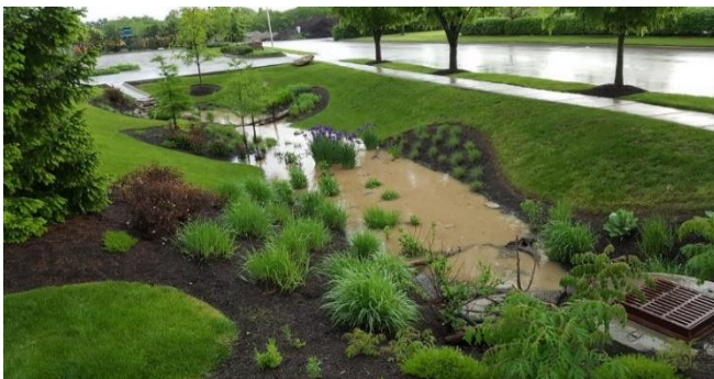
Figure 3: Rain Gardens and Bioretention. Rain gardens are landscaped depressions that capture and treat stormwater runoff, allowing it to infiltrate the soil naturally. Bioswales provides efficient treatment of stormwater through fine filtration, extended detention and some biological uptake. These features help reduce stormwater runoff, improve