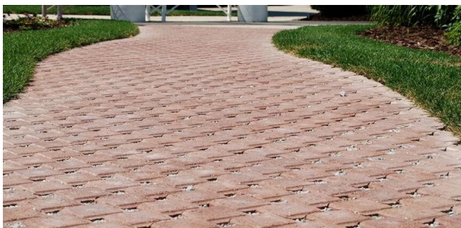
Figure 4: Permeable Pavements. Permeable pavements are surfaces that allow water to pass through them, reducing runoff and allowing water to infiltrate into the ground. They aid in stormwater management, prevent surface water pooling, and contribute to groundwater recharge.