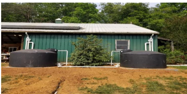
Figure 5: Rainwater Harvesting Systems. Rainwater harvesting systems collect and store rainwater for later use in residential properties. This practice conserves water and reduces the demand on municipal water supply. The figure shows an example of rainwater harvesting on the ground.