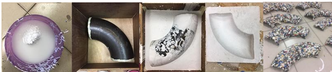
Fig.1: The process of moulding (preparation for POP and model) and the heating process.

At the beginning of my work, I was more concerned with the correct shape to build. I concentrated on the same shape when I was active in the exhibition. I create knotted, twisted, or swirl/rotating conditions. As a result, the finished product of my artworks resembles more of those forms. These include forms like concave rope, twisted and tied roots, and so on. I started by making a model using plaster of Paris (POP), using the most common form I used, the 'L' pipe. With this mould, I can create the shape I want. The use of plastic fragments to create the sculpture is used in the mould, and the heating process is carried out in the mould.