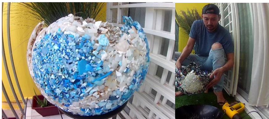
Fig.4: Working place

When I was isolated in my home, I started looking for a suitable mould for my next idea. I was more focused on simple tools that are already in my house. Plastic fragments were placed in a pan, and heating is done using a blower. The curved surface of the pan creates a unique work. I repeated it over and over again to get the desired result. I separated them into colours, then comes the first and place them in the pan according to the colour. The COVID-19 pandemic has had a huge impact on the production of this work. I had to look through household appliances to get this done.