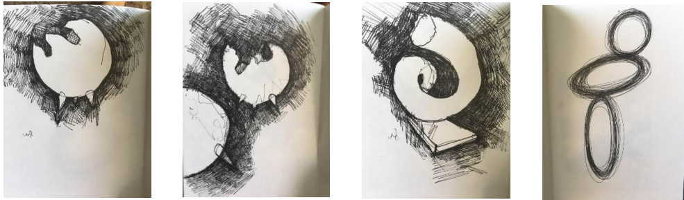
Fig. 5: The sketches to expand and develop the idea.

models, figures, and small-scale jewellery production. So, in my case. I need to use resin to strengthen the effect of the plastic blend.