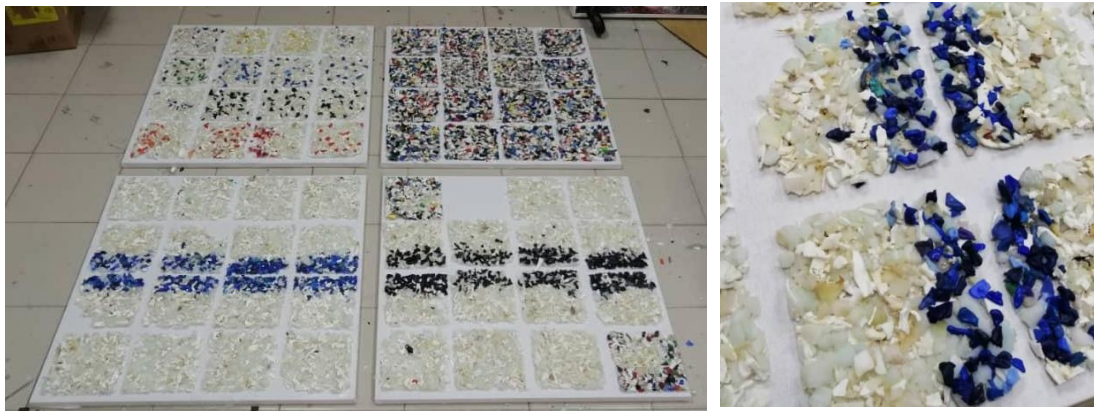
Fig. 3: Polyethylene after heating

To maintain the uniqueness of the textures, I focused on simple and easy shapes like the work of minimalist artists Carl Andre, Frank Stella, and Donald Judd. Rearranging or constructing plastic fragments into complex shapes or materials and minimally assembling them became my motivation. Fig.2 shows the shape glueing together. One question stood out during this process: Will I remove away the shape or maintain the shape? Quite frankly, I am more focused on exploring materials that can be transformed into unique and dynamic.