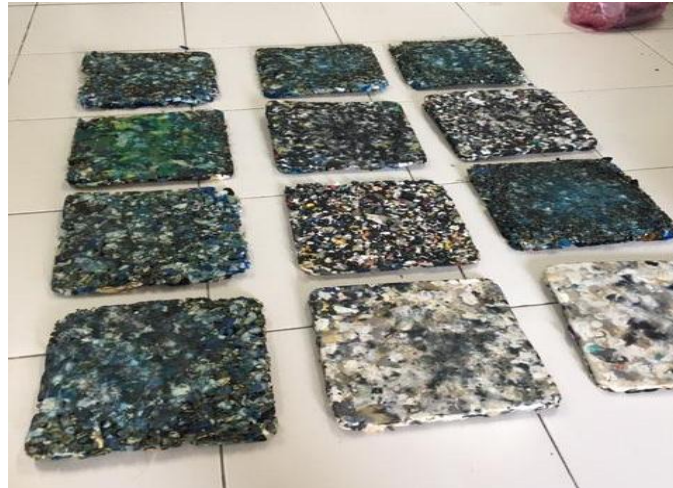
Fig.7: Square shapes from plastic of multiple colours.

Producing a work should have preliminary planning, the following action, and the possibilities that will happen to be aspects in preparing the work. Providing an initial sketch of how to hang the work is very important. To produce art from this plastic material, my research is like a scientist, evaluating, understanding, experimenting, identifying materials, and so on. But I still think the resulting artwork is part of my understanding of the material. What else can this plastic do? This aesthetic process makes this plastic product more appreciated and has an extraordinary impact on me. From the heating and combustion practices I did, I understood the properties of plastic in more depth. Thermoplastic and thermosets are plastic fragments that can melt quickly if heated and harden if cold water is placed on them. At the same time, plastic thermosets are difficult to dissolve and require appropriate techniques to form them. I feel fortunate after the factories are given space to operate again. I can get these plastic sheet materials back quickly and simply. After seeing the final product of crushing plastic, I was interested in the white or crystal colour that results from cleaning from the shower.