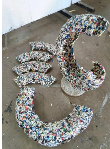
Fig.2: The constructive plastic fragments into works.

To maintain the uniqueness of the textures, I focused on simple and easy shapes like the work of minimalist artists Carl Andre, Frank Stella, and Donald Judd. Rearranging or constructing plastic fragments into complex shapes or materials and minimally assembling them became my motivation. Fig.2 shows the shape glueing together. One question stood out during this process: Will I remove away the shape or maintain the shape? Quite frankly, I am more focused on exploring materials that can be transformed into unique and dynamic.