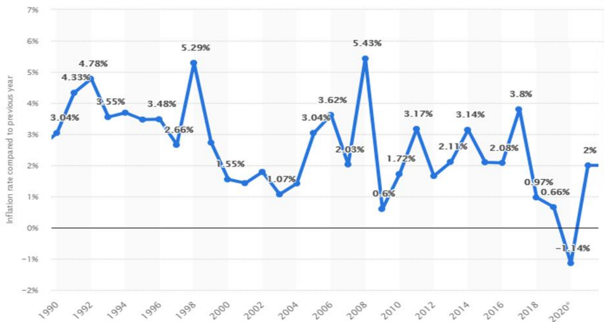
Figure 1: Malaysia's Consumer Price Index (annual, %)

Figure 1 shows the rate of inflation in Malaysia using the consumer price index from 1991 until 2020. From 1991 to 2019, Malaysia's average inflation rate stays between 1% to 5%. However, in 2020, the inflation rate falls to -1.13%.