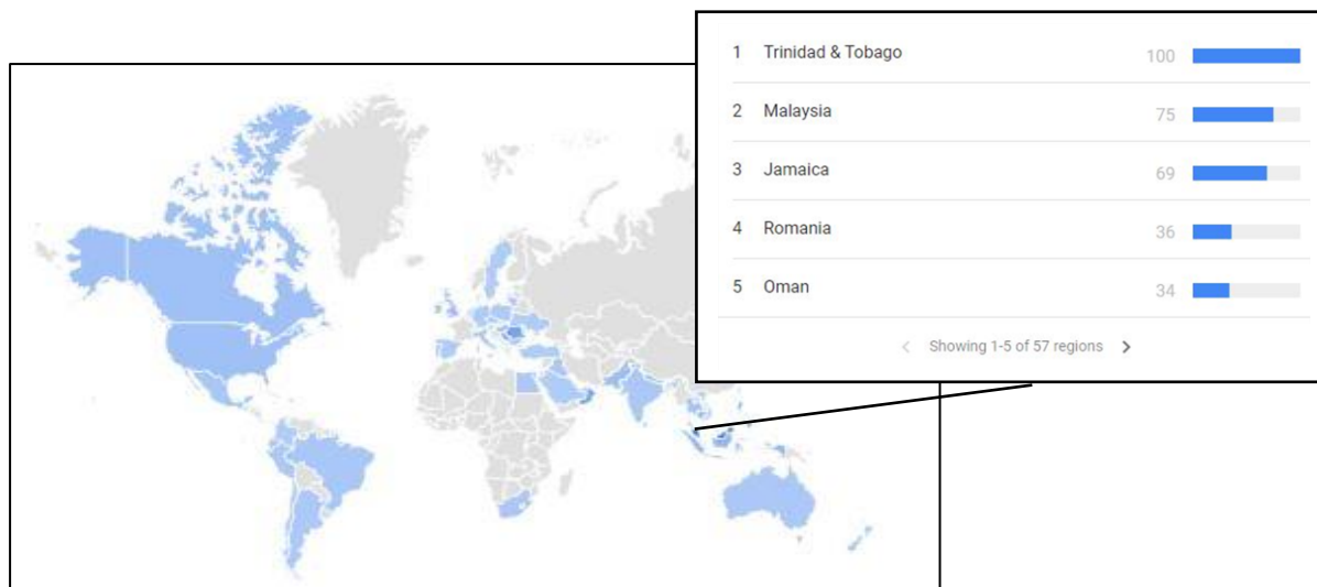
Figure 1 Distribution of Google Classroom Application Users