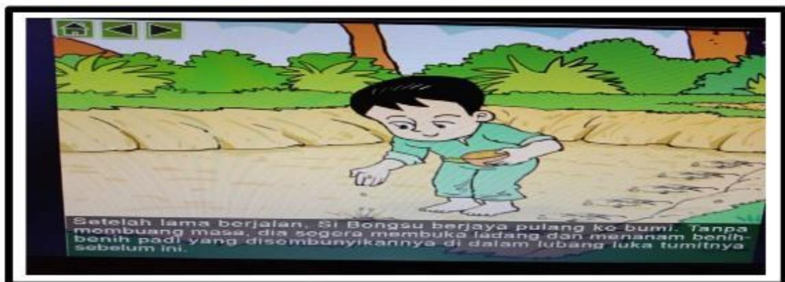
Figure 5: Climax plot in multimedia courseware of 'Asal Padi'