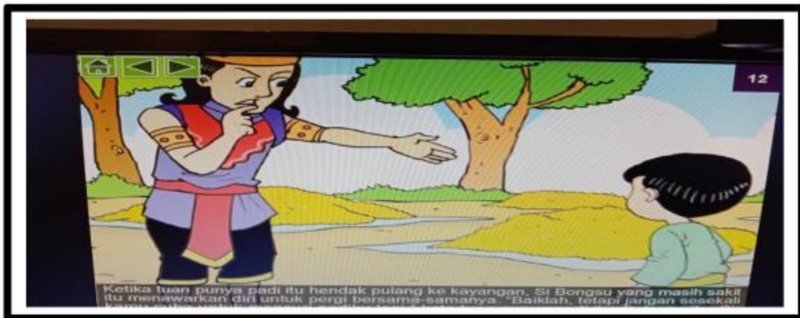
Figure 4: Climax plot in multimedia courseware of 'Asal Padi'