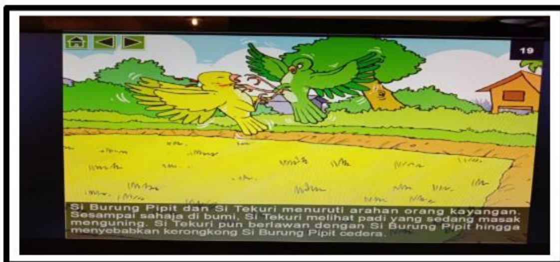
Figure 6: Falling action plot in multimedia courseware of 'Asal Padi'