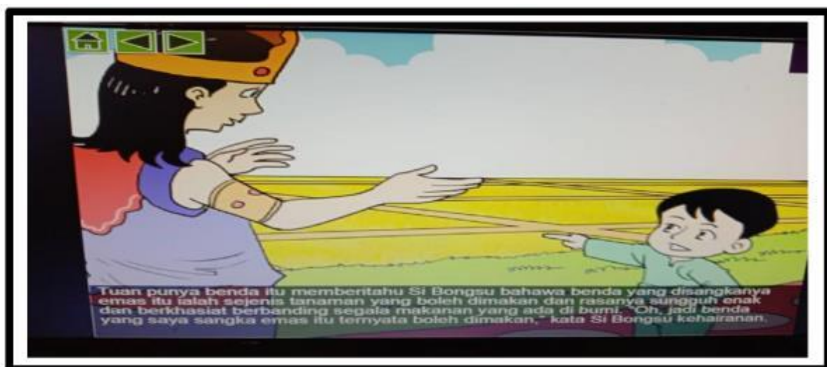
Figure 8: Characters' graphic