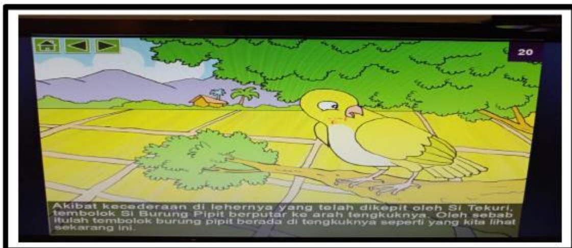
Figure 7: Falling action plot in multimedia courseware of 'Asal Padi'

Based on the story plot construction above, teenagers will be shown with a text display through the plot construction that begins with the beginning of the story, development, conflict, climax and resolution that explains the storyline of the literary work 'Asal Padi'. This is in line with Gagne Information Processing Theory (1975) that is in the Code Storage Phase where adolescents will be able to record ideas from the text displayed on the multimedia courseware by observation and can remember the plot structure of the story. According to Noreliana (2012) study, each individual processes information in a different way. Therefore, this diversity in thinking will influence adolescents to act on the courseware material.