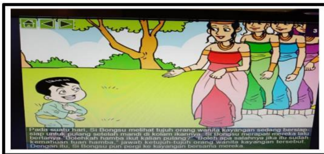
Figure 2: Rising action plot in multimedia courseware of 'Asal Padi'