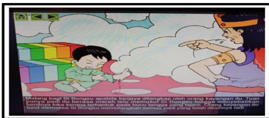
Figure 3: Complexity / conflict stage in the multimedia courseware of 'Asal Padi'

Based on this work, a conflict occurs when Si Bongsu steals a rice seed by putting it in his mouth. It is unfortunate for Si Bongsu when his actions are realized and he is arrested by a fairy. The youngest was beaten and knocked to the floor, causing his heel to be injured due to hitting the sharp corner of the rainbow stairs. (Page 19, slide 18). Like the example: