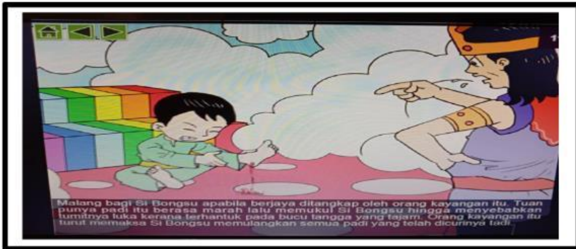
Figure 10: Audio and its relationship with traditional prose of Asal padi

shows the relationship between multimedia elements and literary features through the use of audio and visuals in the traditional prose of Asal Padi. Audio examples: