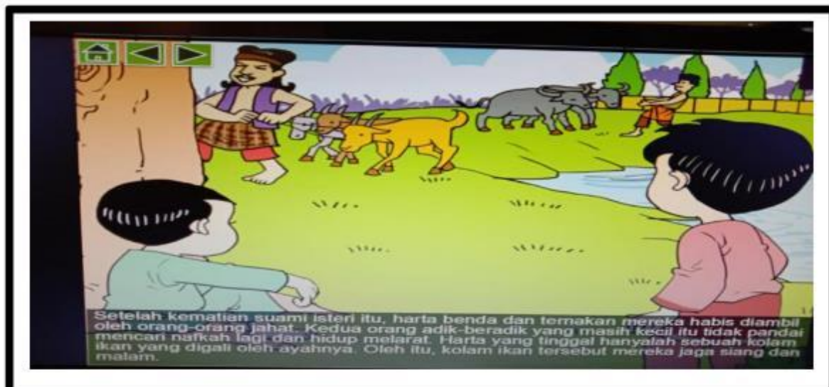
Figure 9: Graphic of the setting in the traditional prose of Asal Padi

Through this Response Phase, adolescents will focus on the graphics found in the Origin of Paddy courseware. The use of visuals or graphics as the figure shows the main character Si Bongsu and side characters and shows the setting found in the prose. The graphics shown are also colourful and an attraction to teenagers to understand each character and character and setting. According to Murray et al. (2005), creativity -based visuals play a role in stimulating thinking and enhancing the value of individual life. This can be linked to Information Processing Theory (1975) because adolescents will stimulate long -term memory to look at the overall visuals displayed in the Asal Padi courseware. In addition, Stephen & Anthony (2002) also stated that the recipient of the visual message will interpret with its own interpretation. It is also emphasized by Smith et al. (2004) by stating that visuals will carry multiple meanings and cause different levels of response from recipients. Here, teenagers will see the visuals of Si Bongsu's character stealing rice while he is in heaven and set against the backdrop of a place in heaven and the process of storing information about the visual will take place on long-term memory.