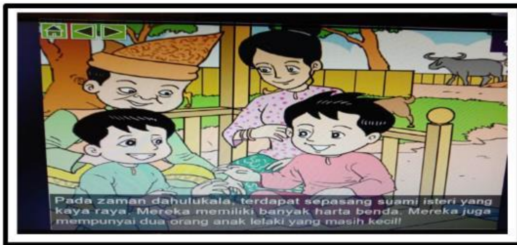
Figure 1: Exposition plot in multimedia courseware of 'Asal Padi'

According to Siti (2011), the exposition stage presents the background information to enable the reader to understand the story in an orderly manner. Among the information is regarding the protagonist and antagonist characters, the basis of the conflict, the background of the story, events, flashback and so on. Author present such information through dialogue, portrayal, flashbacks or live descriptions. The onset is usually a current event and over a short period of time. This section usually ends with a stimulating incident, like there is one incident in the action of the story that is not told in this section. Such stimuli are used as motivation to the reader to follow the next action or event or referred to as development. Through this work, the story begins with the author telling the family of 'Si Bongsu' who lives happily with his brother, father and mother. Like the example: