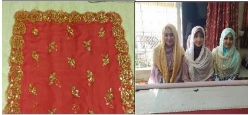
Figure 8 : Shawl from Kelantan and the researcher with an embroiderer who is still actively embroidering kelingkan .