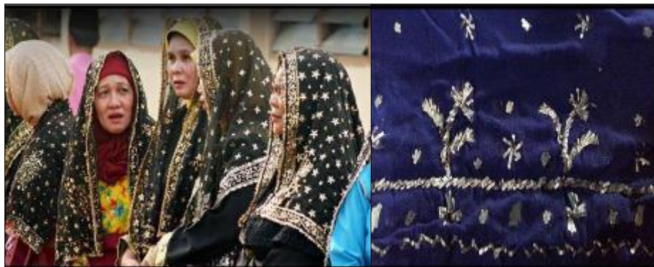
Figure 7 : Pictures taken from an article entitled “ Selayah Keringkam dan Selayah Manto: Sulam Budaya Melayu Sarawak (Malaysia) dan Melayu Daik (Indonesia) ” by Sarkawi & Abd. Rahman, (2014)