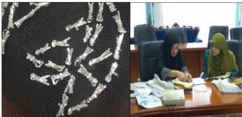
Figure 9 : The ribbon technique of Selangor's kelingkan shawls and the researcher learning to embroider at PADAT or the Selangor Malay Customs and Heritage Corporation.