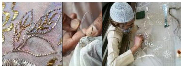
Figure 2 : Pictures of makaish or mukaish embroidery