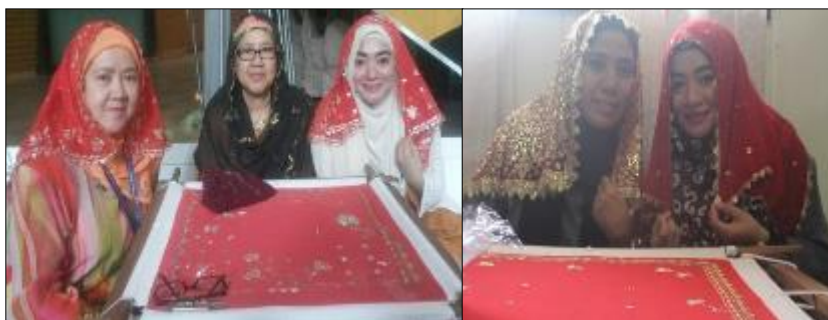
Figure 6 : The researcher with embroiderers who are still actively embroidering kelingkan .