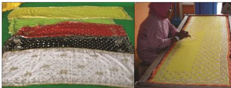
Figure 4 : Pictures taken from an article entitled " Makna Tudung Manto bagi orang