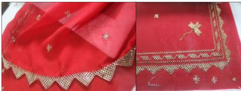
Figure 5 : Kelingkan embroidered shawl and selayah from Sarawak

Requests for kelingkan embroidery continue to this day although it is on a small scale. Orders for kelingkan shawls and selayah for weddings are most popular among Malaysians, although it is sold for a high price starting from RM1000 and above.