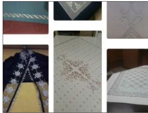
Figure 1 : Pictures of Tel Kirma taken from a website: https://tr.pinterest.com/pin/387520742921795191/