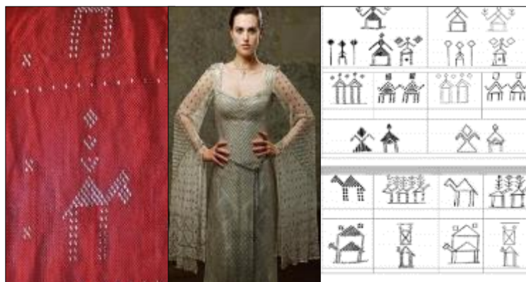
Figure 3 : Pictures of Tally taken from a journal entitled "Utilization of aesthetics value of tally woven fabric structures in fashion trends" by Elnashar et. al (2014).