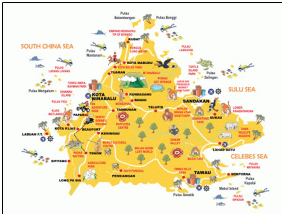
Figure 2. Map showing Ranau district in Sabah

This study uses the mixed method which is a combination of quantitative and qualitative methods. The data used are primary data and secondary data. Primary data is the data collected from the field using questionnaires that were distributed to the respondents. This primary data is seen to provide a clearer picture of the actual situation in the study area (Barbie, 2009). The secondary data was used to provide additional information concerning issues studied and examples of secondary data used are information obtained from brochures, newspapers and information from the Internet. This study uses the non-probability sampling method with sample selection made on a simple sampling (convenient sampling). Through this method, individuals were chosen to be likely incidentally or chosen because the individual is believed to be able to provide the necessary information. Therefore, not everyone has the same opportunity to be chosen as a sample. The sample size is 200 people targeting the sample features of tourists and locals based on the target number of respondents according to tourist location as shown in Table 2.