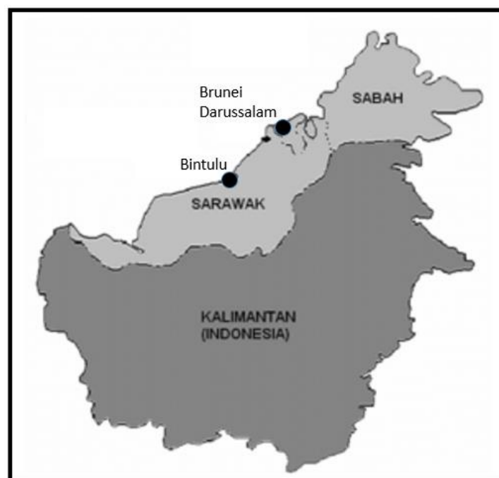
Figure 1: Borneo Map

The oil and gas industry are one of the most dangerous and high-risk activities which contribute to critical economic activity for Malaysia. One of the active sites that involve in this activity is Bintulu, which is in the Tropics as shown in Figure 1. There is a frequent major incident happened around the world involving this industry, example tank fire, explosion, and gas leak. Numerous fatal and non-fatal injuries occur from various activities carried out in maintaining and operating the facilities. These included working at height, critical lifting, working with high voltage equipment, working in H2S area, handling hazardous chemicals, exposure to radioactive material, and others. Due to the complexities of the technology, hazard, and risk exposure in oil and gas industries, specific competencies and skills are required by personnel before they enter the industries and performed the job safely. It is highlighted that incident are often complex involving multiple causes which include the level of personnel competency (Bhusari et al., 2020).