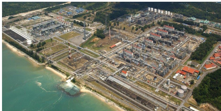
Figure 2: On-Shore Plant Facility

Moreover, most of Oil and gas facility in Borneo/Tropics falls under Major Hazard Installation (MHI) as per DOSH regulation, which requires the industries to have effective HSEMS that helps organization to ensure safe operation of the facility as shown in Figure 2. Training and competency are one critical element/pillars that need to be in place to ensure people are being equipped with the right knowledge, skills, and experience to work in the oil and gas industries. Safety training emerged as a significant predictor of safety knowledge, work-related injuries, and workplace accidents. Hence, this research aims to develop an assessment tool for contractor worker's HSE competency in the oil and gas industry in Borneo/Tropics (Liu et al., 2020).