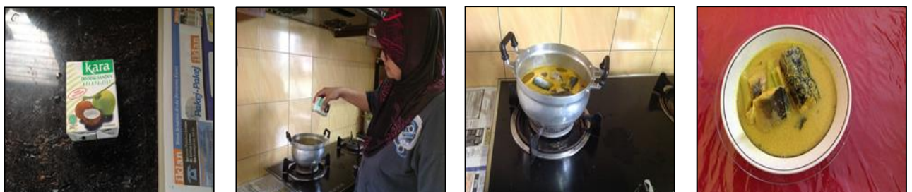
Figure 1: Demonstrates the use of coconut cream in making gulai ikan where it reduces the hustle of grating and squeezing the coconut to get its cream