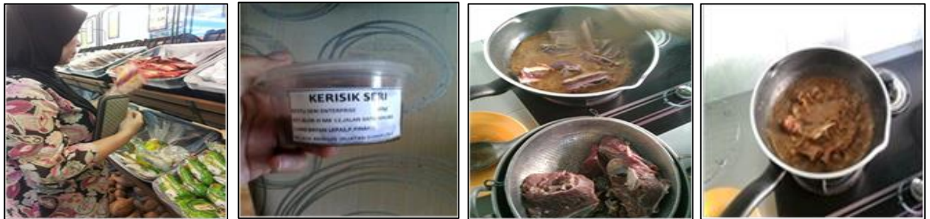
Figure 2: The use of kerisik in making one of the traditional dishes. It took one hour if we produce kerisik manually

Nowadays, there are many convenience ingredients available in the market where the products ease or cut short the process of producing Malay traditional foods. Some of the convenience ingredients are blended chilies, coconut cream, cooking paste, slice beef, cut chicken, tamarind paste and many others. All these convenience ingredients support the new generation in practicing the Malay traditional dishes due to the simplicity and suitability offered by the convenience ingredients. Most significant motivation with the availability of convenience ingredients, it has made the cooking process shorter and the kitchen less messy due to less preparation before performing the cooking.