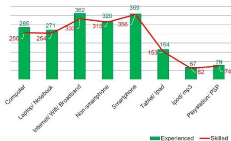
Figure 2. ICT Experience vs ICT Skill

According to figure 2, ICT experience and skills were identified based on the ICT tools listed. The measurement for ICT experience was based on, have used the ICT tools for at least 1 year, and whether they know to at least operate and applied the ICT tools into reasonable meaning measuring the ICT skills. Most of the respondents have experienced more than 1 year of use and know very well how to use a smartphone, Internet, non-smartphone, computer, and laptop. Based on these experiences and skills of ICT tools among rural communities have shown that positive capabilities and readiness level towards a digital society. Most of them are familiar with the ICT tools which will increase their usage towards obtaining digital content. Even if they did not own the ICT tools by themselves, according to their experience and skill, they still can use their peers or ICT services and facilities provided within their local community. The digital usage practice seems not a big problem for rural communities by using these ICT tools.