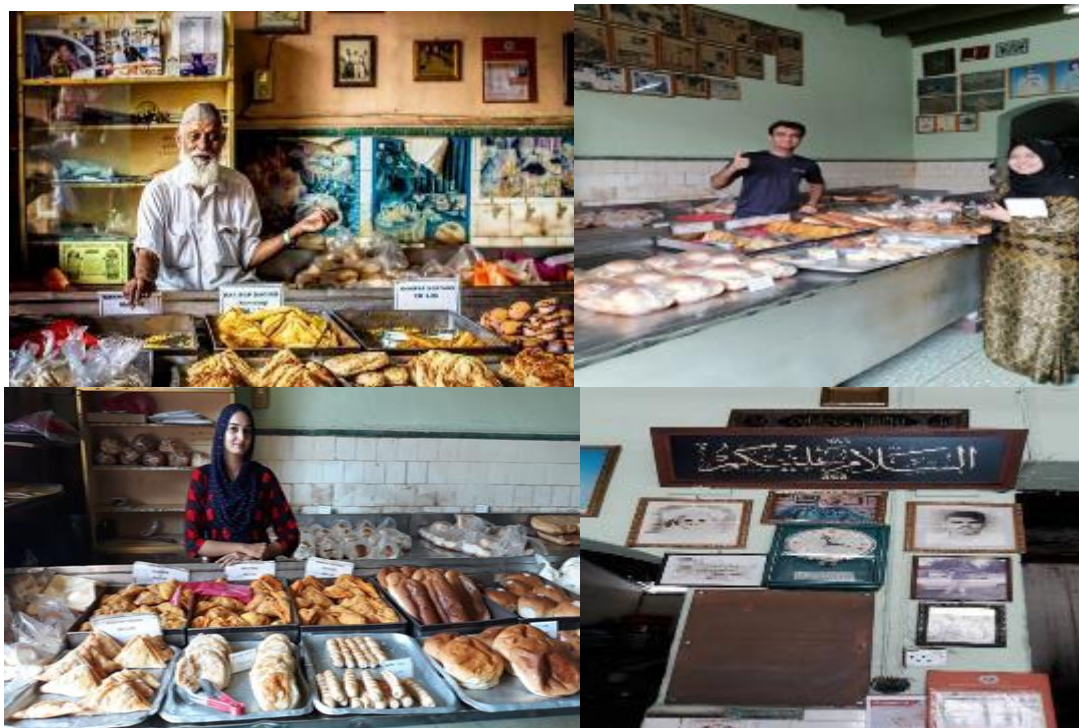
Figure 6. The owner takes turns with his son and daughter in managing the store.