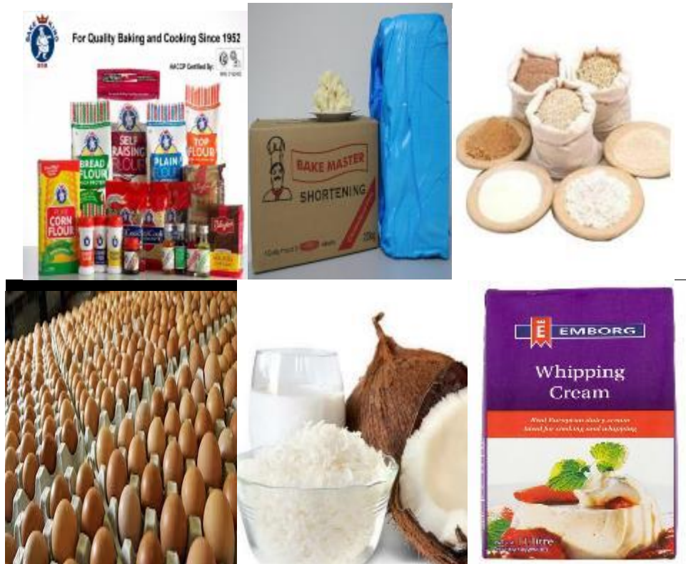
Figure 4. Types of raw materials used.