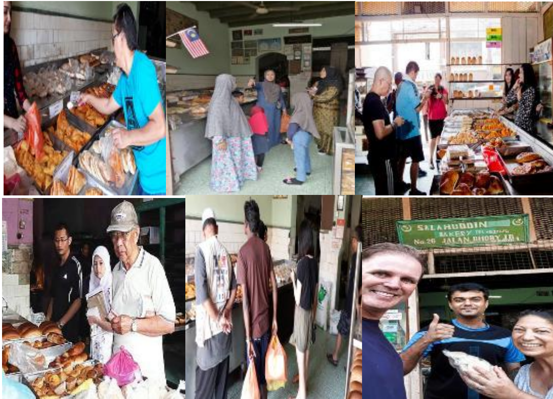
Figure 5. Some of the regular customers at Salahuddin Bakery.