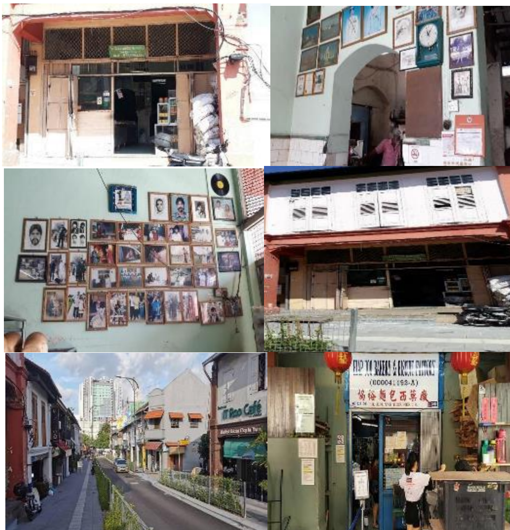
Figure 1: Street of Johor Bahru Old Town where Premise of Salahuddin Bakery is located