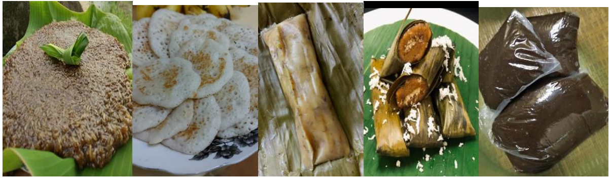
Figure A7 Figure A8 Figure A9 Figure A10 Figure A11