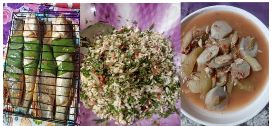
Figure A4 Figure A5 Figure A6