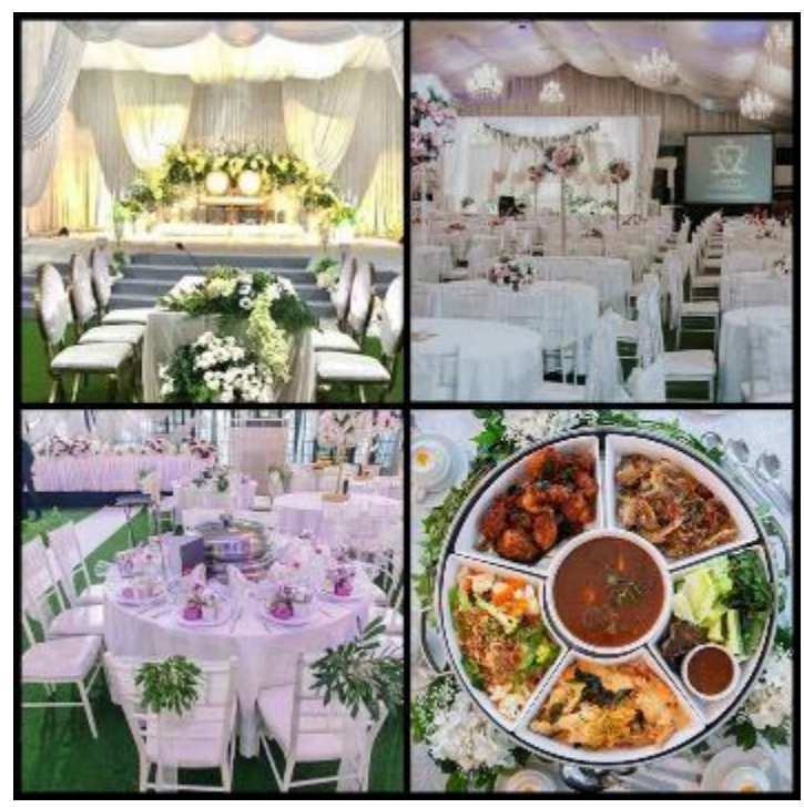
Figure 1: Wedding and exclusive venues