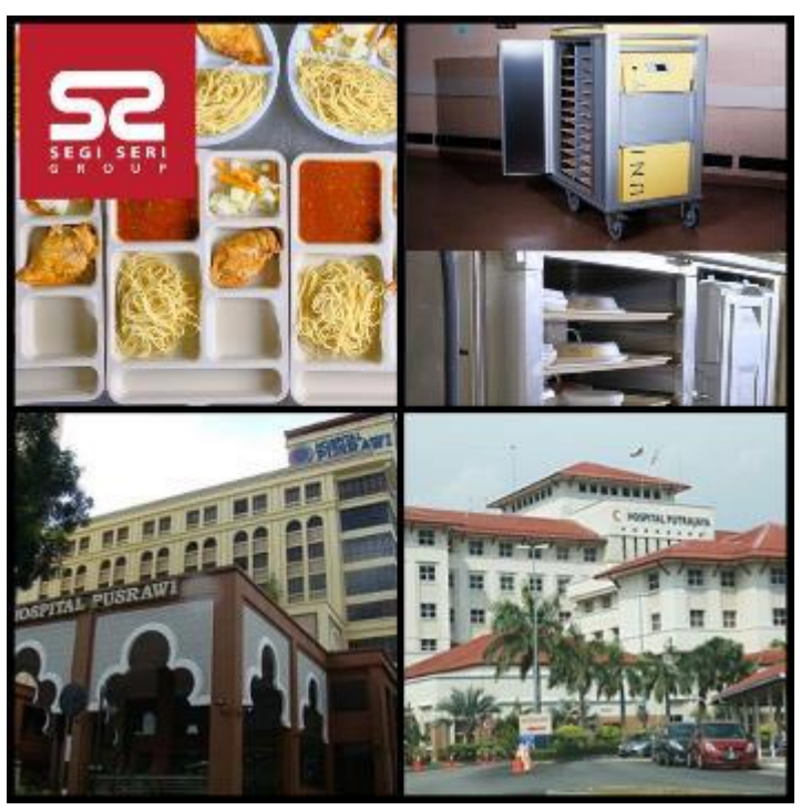
Figure 2: Hospital in-patient meals