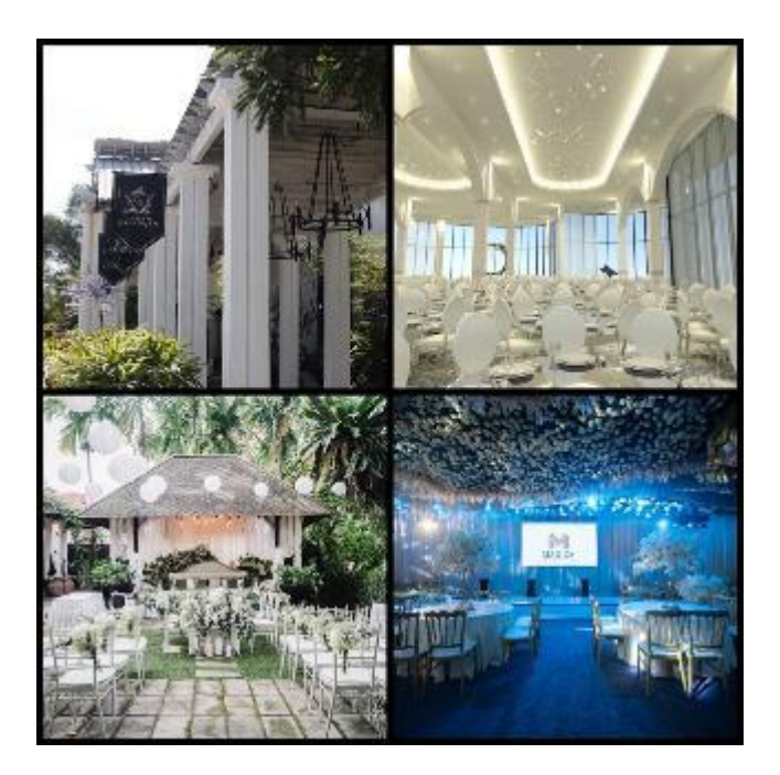
Figure 5: Seri Segi venues that require monthly rent payment

Vol. 11, No. 16, 2021, E-ISSN: 2222-6990 © 2021