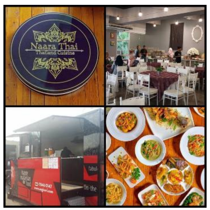
Figure 3: Food truck and restaurant under Segi Seri

Vol. 11, No. 16, 2021, E-ISSN: 2222-6990 © 2021