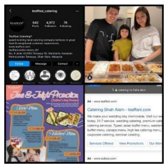
Figure 7: Teaffani catering promotional material

Vol. 11, No. 16, 2021, E-ISSN: 2222-6990 © 2021