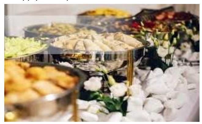
Figure 4: The ingredients and equipment for the catering services

From a seller's point of view, the cost is the amount of cash spent in providing products or goods. If the sellers sell their goods at the same price as they cost to supply, they would only achieve the breakeven point but not gain any profit margin. Therefore, the price of a product from the buyer's point of view needs to be calculated carefully. This is the amount charged by a vendor for a product. It includes both the value of the merchandise and the mark-up cost added by the vendor to supply it at a profit.