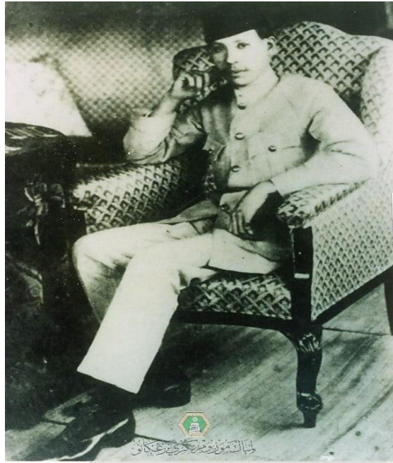
Figure 3. Sultan Muhammad Syah II.