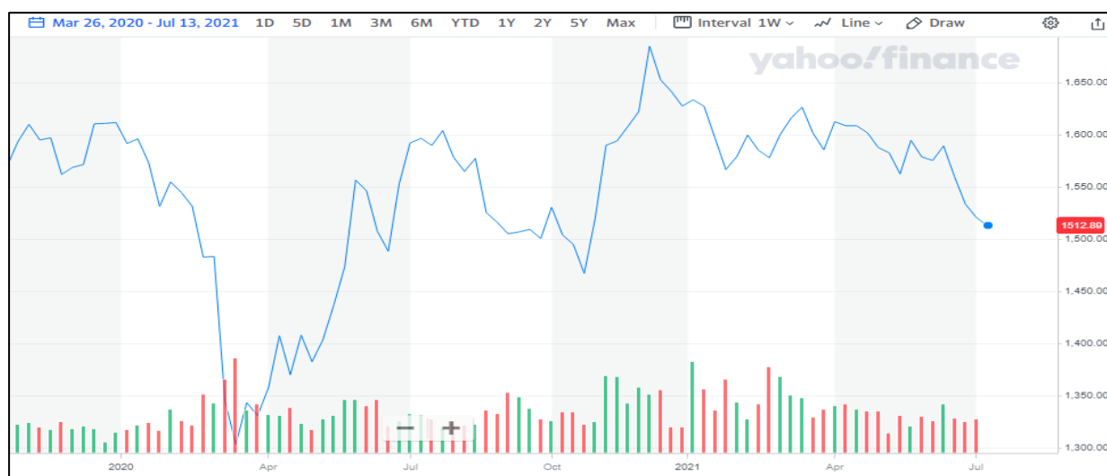
Figure 1: FTSE Bursa Malaysia KLCI from January 2020 until July 2021

Moreover, according to Lee, Jais, and Chan (2020), in general, the FBM KLCI has been declining since January 2020, reaching a low of 1,219.71 on March 19, 2020, the second day of the Movement Control Order (MCO), which is an initiative of the government of Malaysia to overcome the COVID-19 pandemic. This situation can be shown in Figure 1.