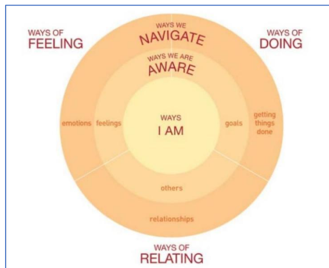
Figure 1: Ways of Being Model (Blyth et al., 2017)

child's first context of socialization and it also provides opportunities for a safe and supportive SEL environment. Learning can take place through modeling (implicit) (Bandura, 1977) or communication (intentional) (Gomez-Ortiz et al., 2018). Besides that, family is also important as it teaches children emotions that are culturally desirable. By providing opportunities for SEL, children could understand the connection between emotions, behaviors, and well-being (Dworkin & Serido, 2017). Hence, raising the importance of examining family factors that could influence emotional competence development.