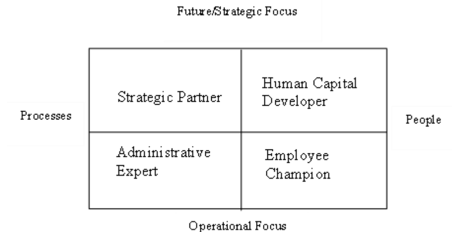
Figure 2: The Ulrich Business Partner Role Model (Ulrich and Brockbank, 2005)

To complement the model, Wright (2008) proposed that HR roles can be a medium to support performance. Parallel to Wright (2008); Bahuguna et al (2009) suggested that HRM activities has turned strategic to fully utilize HRM ability to support firm performance. Notwithstanding, as functional expert is a role that represents how HRM activities are carried out in an organization, it acts as a medium that transmit the process and operations of HRM activities to employees (Bhatnagar and Sharma, 2005; Amarakoon et al. ,2019; Bamber et al. , 2017). Hence, functional expert is omitted, given it is a deliverable that acts as a medium for HRM activities and not related to the strategic role context. From this discussion, the hypothesis for strategic HR roles and firm performance is developed: