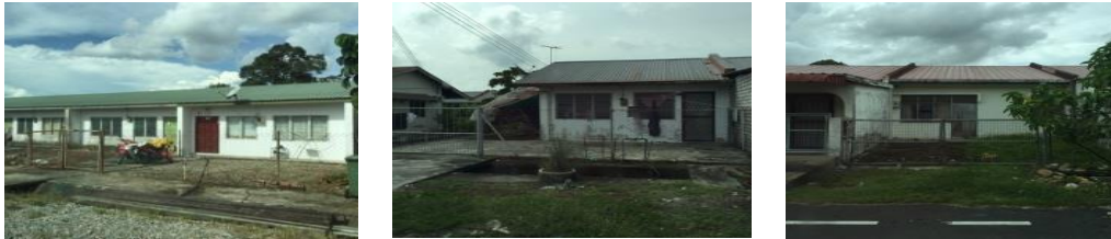
Figure 1: Examples of low-cost terrace houses

the Ministry of Housing and Local Government (Idrus & Ho, 2008). In the Eighth Malaysia Plan between 2001 and 2005, the government wished to carry out a program for upgrading and improving the low-cost public housing to make sure the well maintenance of the public amenities, buildings and common facilities. The Figure 1 shows examples of low-cost terrace houses.