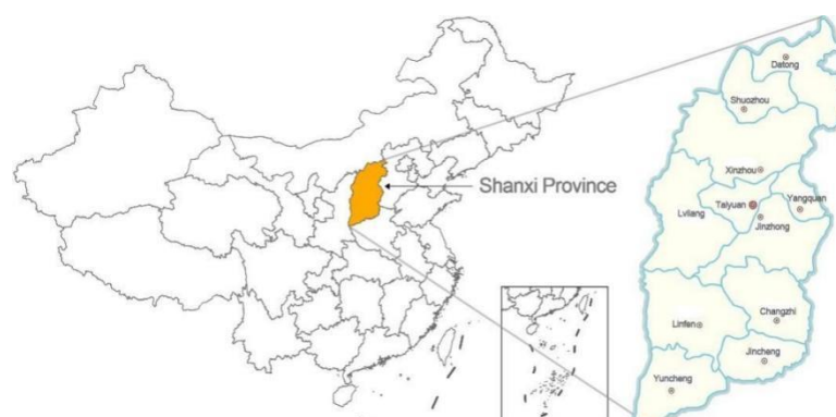
Figure 1: Shanxi Province and divisions

Aligned with the research topic, this study endeavors to integrate the artistic attributes of new media into the realm of digital heritage tourism focusing on Shanxi's ancient architecture. Furthermore, in the context of developing digital heritage tourism initiatives in Shanxi, new media is envisioned to serve as a conduit for providing informative travel guidance, thereby addressing practical challenges encountered by the government and stakeholders involved in the preservation and promotion of Shanxi's ancient architectural heritage.