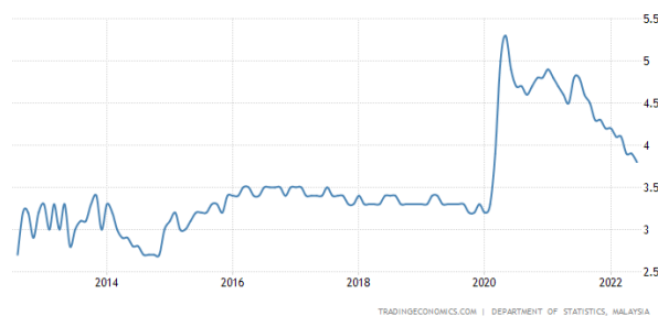
Figure 1: Unemployment Rate in Malaysia

The underlying problem in this study is that failure in choosing a career preference can make unemployment in Malaysia to increase year by year.