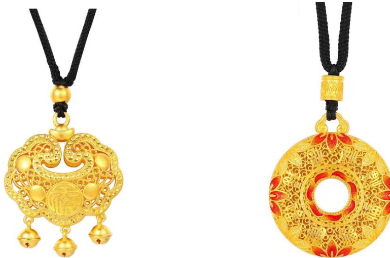
Figure 1: 'Fu' Character Ruyi Lock (left) and 'Fu' Character Peace Buckle (right)