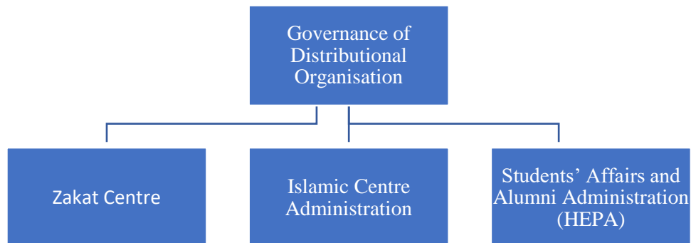
Figure 1: Governance Form of IPTA Zakat Distributional Organisation

The findings of the study will discuss four aspects of zakat aid distribution management in Southern Region IPTA which were the organizational structure of zakat aid, zakat distribution fund source, zakat beneficiary category and zakat distribution form.