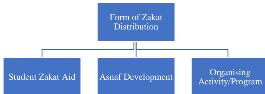
Figure 3: Form of Zakat Distribution Bentuk Agihan Zakat

miskin student in UTeM refers to a student who has a family income between RM1500 and RM4850 monthly. Clearly, the determination of asnaf fakir and miskin in Southern Region IPTA is based on had al-kifayah published by MAIN and also the classification of household income class in Malaysia. Besides that, student who is in asnaf fakir category faces more life difficulties than asnaf miskin students.