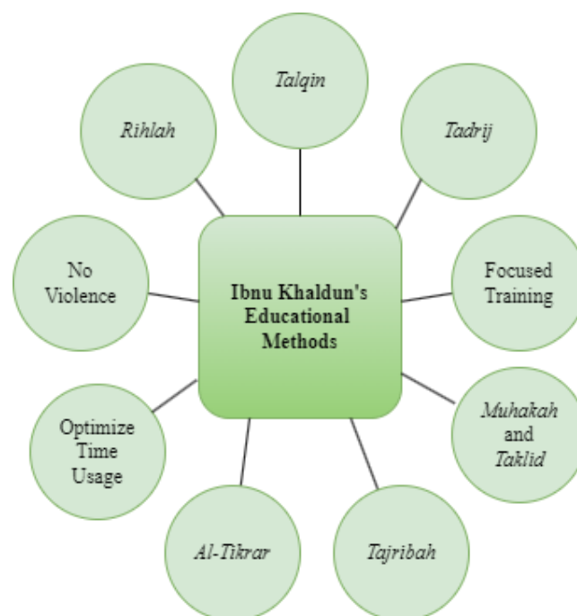
Figure 2. Ibn Khaldun's Educational Methods

According to the research by Abidin et al. (2017) in a study titled " Exploring Ibn Khaldun's Educational Methods in the Book of al-Muqaddimah ," seven teaching approaches of Ibn Khaldun have been outlined as shown in Figure 2.