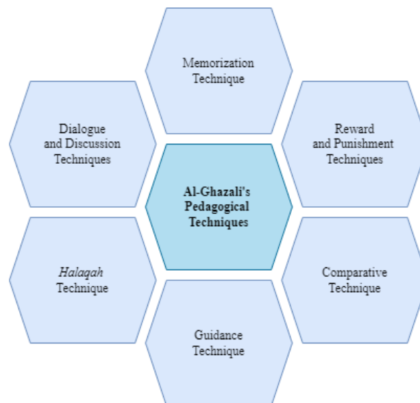
Figure 1. Al-Ghazali Pedagogical Techniques

The detailed breakdown of Al-Ghazali's pedagogical techniques, as illustrated in Figure 1, is explained below: