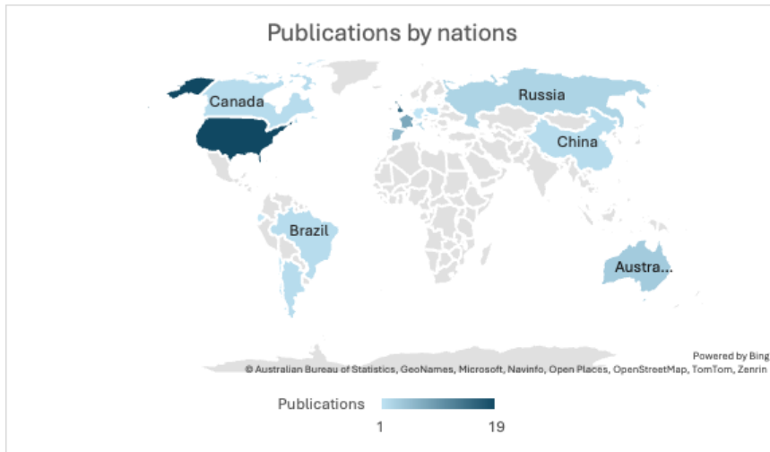
Figure 3: Distribution by nations of Principle of obedience in workplaces for the last 20 years

The figure above depicts the distribution of research publications on the principle of obedience in workplaces across various nations. The map reveals that the United States leads in scholarly output, with a total of 19 publications, indicating a strong focus on this area within American academic circles. This prominence may be attributed to the diverse and complex nature of the U.S. workplace environment, which has been a fertile ground for exploring issues of authority and compliance.