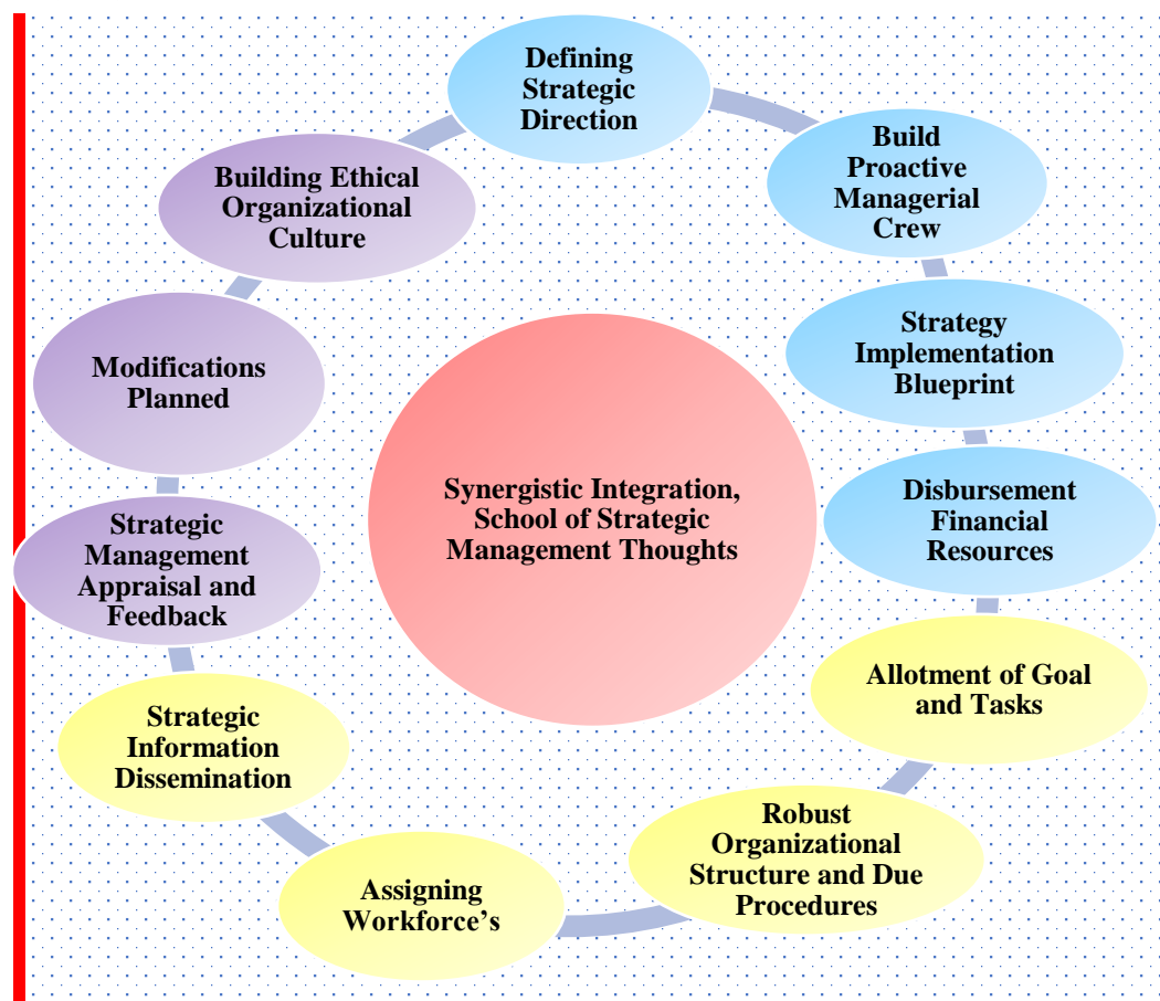
Figure 2: Synergistic Integration of the School of Strategic Management Thoughts and Implementation Model