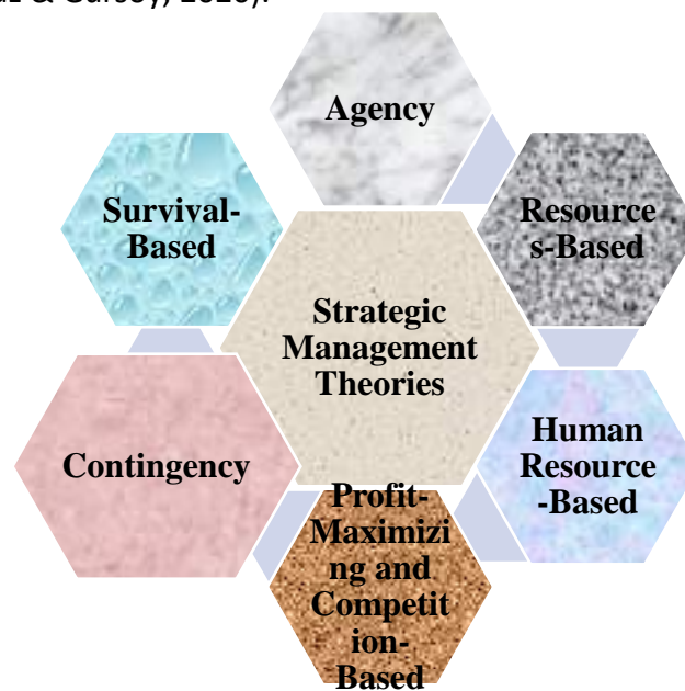
Figure 1: Strategic Management Theory Model

The chart below elucidates the predominance of strategic management theories as underpinned by scholars and subsequently explains theories such as agency theory, contingency theory, resource-based theory, human resource-based theory, survival-based theory, profit maximization, and competitive-based theory of firms (Raduan et al., 2009; Omari et al., 2011; Omalaja & Eruola, 2011; Aljawarneh & Al-Omari, 2018; Rustamadji & Omar, 2019; Akyuz & Gursoy, 2020).