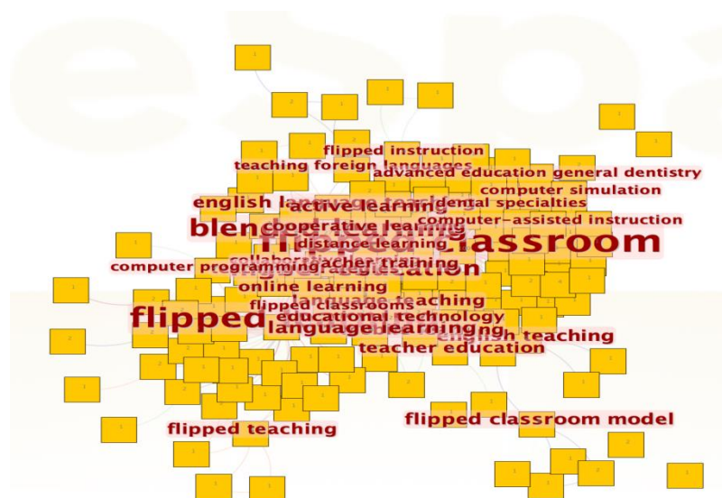
Figure 3: Visualization of literature graph

Figure 3 shows the visualizations of articles about the flipped classroom and language teaching: