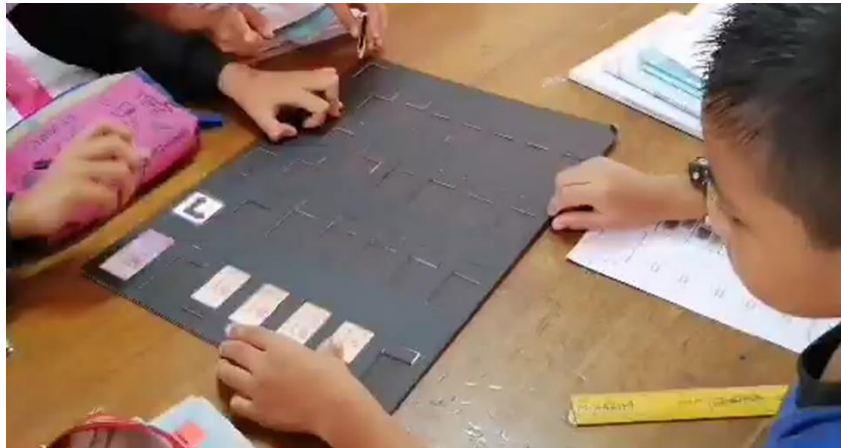
Figure 1: Money Learning Kit

For example, for money exchange, the teacher instructs the student to withdraw the value of money of RM58, and the student has to find the boxes that contain examples of cash until it reaches the total value of funds of RM58. This kit helps teach and learn about money topics, including add and subtract operations. Students need to find the correct amount of money by counting the money sample squares on the kit. This kit is suitable for students who are weak in mental calculations, and they can use it to help them calculate the total value of money.