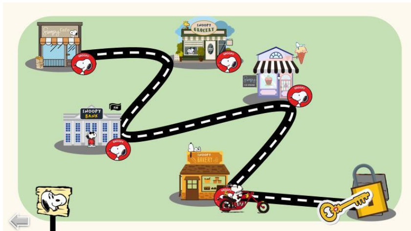
Figure 2: An example of a digital game

The digital game aid is divided into five stations showing different situations related to the student's daily life. Each station has its requirements and ways to complete it, and students need to unlock the station before it can be played. The condition for obtaining a station key is to answer at least three questions correctly out of five questions for each station. If a student fails to complete a station's requirements, they are allowed to replay the failed station. Figure 2 shows the stations pupils must go through to help Snoopy's character find his way back home.