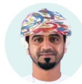
Figure 4: instructors’ profiles

Bachelor of Arabic Language, Sultan Qaboos University, Sultanate of Oman