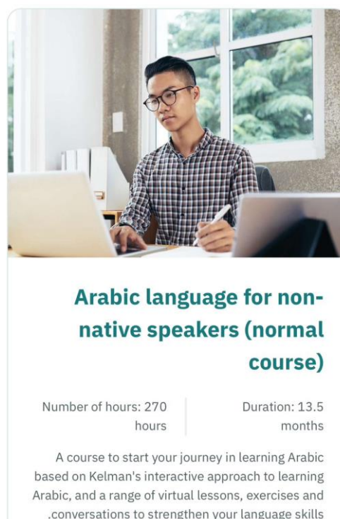
Figure 3: Normal course example

Start learning Arabic and honing your language skills in reading, writing, speaking and listening through basic courses on the Hebron platform