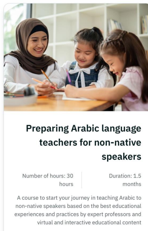
Figure 2: An example of the course.

The Khalil platform aims to offer its programmes to a diverse range of learners, such as Arabic-speaking school students, university faculty and students, teachers, government officials, lawyers, media professionals, and individuals interested in studying the Arabic language. Non-Arabic speaking learners include students studying Sharia sciences, the Arabic language, Middle Eastern studies, imams, orators, diplomats, and businesspeople. Figure 2 shows an example of the course.