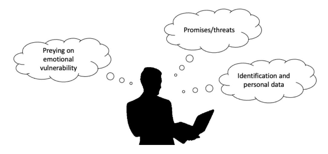
Figure 2. Recruitment and advertisement for trafficking purpose

The first dimension is for the recruitment and advertisement by perpetrators and targeted towards the potential victims. Wide variety of media was used to reach to the potential victims, to identify the likelihood of the persons susceptible to become victims and to communicate with them, such as telephone calls, emails, social media, and even printed materials. The role of technologies in facilitating trafficking in persons is described in the following Figure 2 .