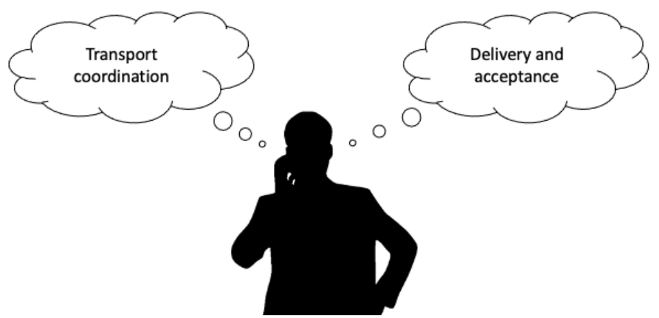
Figure 3. Role of technology to facilitate transportation of trafficking victims

Transporting trafficking victims from their home country to the destination, whether by road, air, or sea, is the second dimension of the problem. Using each of these means of transportation would necessitate delicate communication and collaboration among the persons involved, and they would be forced to rely on technology equipment and gadgets, as well as communication channels, in order to coordinate their efforts, as shown in Figure 3 .