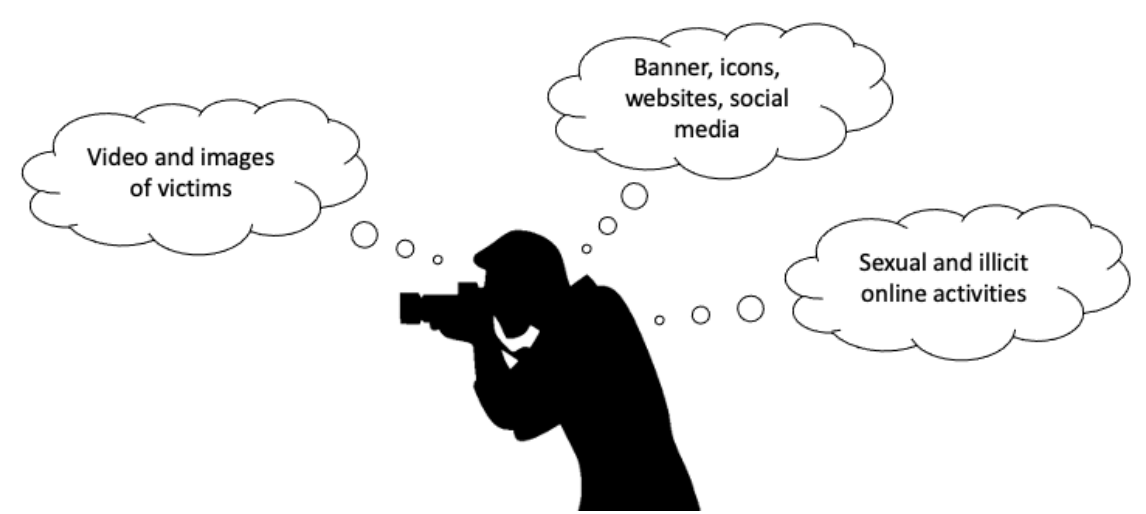
Figure 4. Technology in exploitation of trafficking victims

The third dimension is for the purpose of exploitation itself, i.e. for the purpose of carrying out the exposing, exploitation, and weakening of the victims, for which technology tools are also widely employed and prevalent, some of which are highlighted in the following Figure 4 .