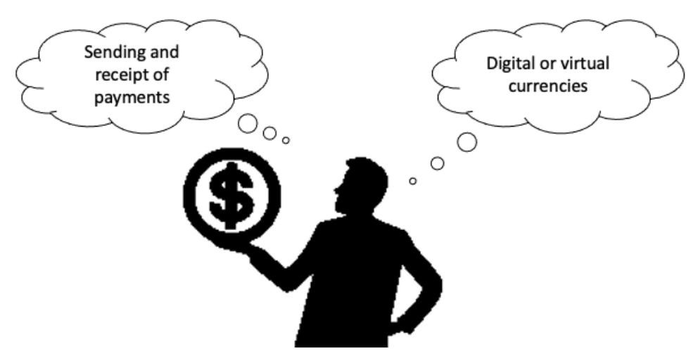
Figure 5. Trafficking financial management engaging in technology

The final dimension on the role of technology in facilitating trafficking in persons is the financial management, in which monetary funds and payments are sent and received using online banking and at certain points, involve digital or virtual currencies as shown in Figure 5 below.